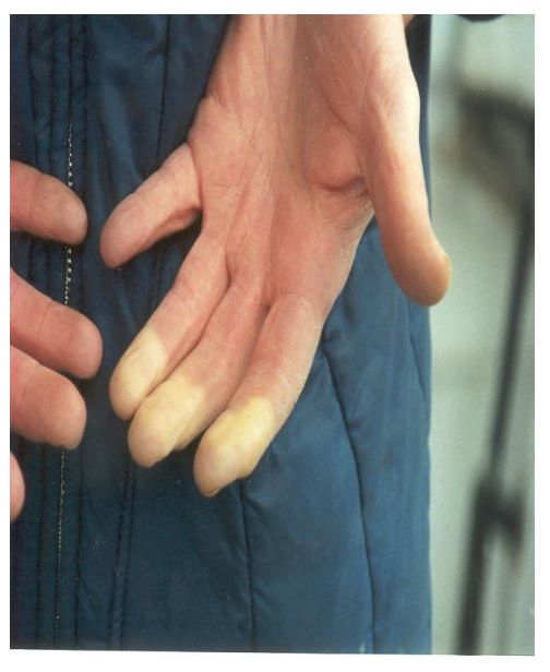
RAYNAUD'S DISEASE FROM WORK IN THE FROZEN GOODS DEPARTMENT AT A SUPERMARKET.