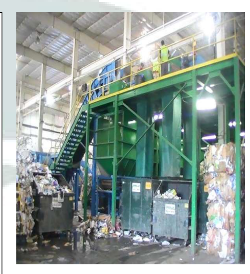
Fall incidents are a leading cause of work-related hospitalizations.

As of 3<sup>rd</sup> quarter reporting by hospitals for calendar year 2023, 379 individuals, two of whom died, were hospitalized for an acute work-related injury. The average hospitalization was for six days, and the median was three days. Hospitalizations were more common among men (84%) and white workers (76%). The age of hospitalized workers varied from 18-88 years of age; the average age was 46 and the median age was 45.