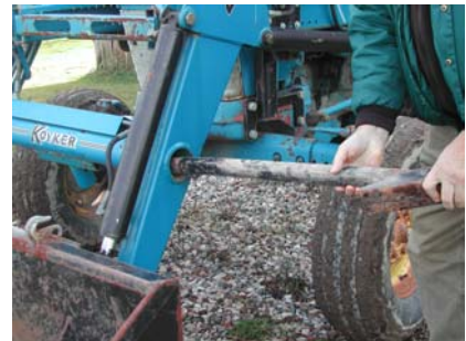
Figure 13. Location of support storage