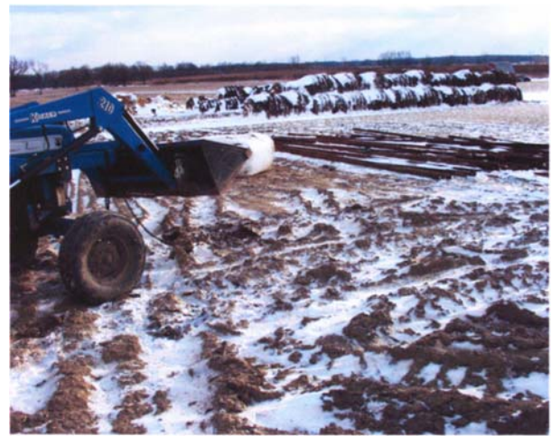
Figure 3. Ground conditions and moved tractor after the incident