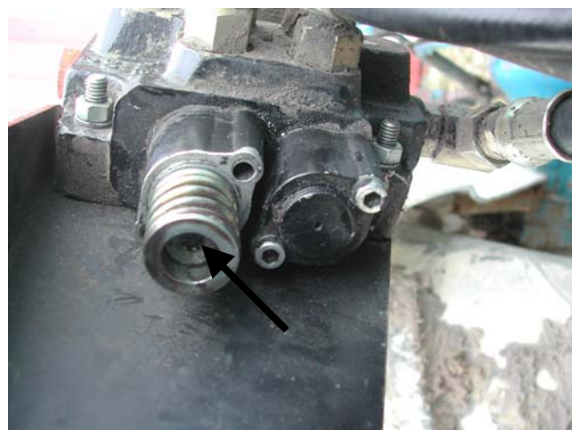
Figure 7. Setscrew controlling hydraulic valve

She tightened the setscrew and that resolved the independent loader arm movement for a few months. After a few more months use, the setscrew loosened again and the loader arms raised independently. The setscrew, according to victim's wife has loosened an additional two times. Each time she tightened the setscrew resolving the problem and continued to use the tractor.