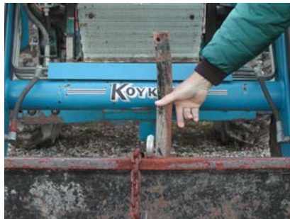
Figure 12. Single central support location