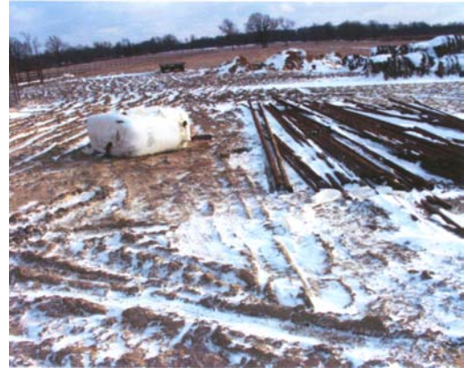
Figure 1. Overview of incident layout and terrain