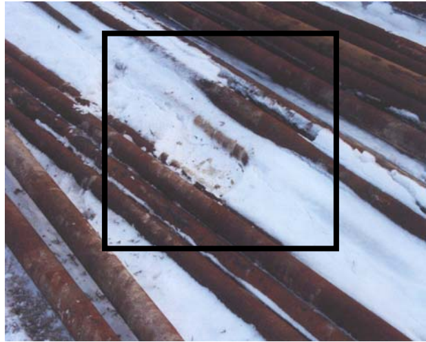
Figure 4. Mark of right front tractor wheel on metal pipes

The victim's wife stated that the victim had twisted to look toward the rear of the tractor in her direction while backing up with the hay bale in the bucket in a low position, approximately three to four feet off of the ground. The rear wheels rolled into a depression and became stuck. The police report states that the left front tractor tire was directly on the ground and the right front tractor tire was on the metal pipes. See Figure 4 for the right front tire mark on the metal pipes.