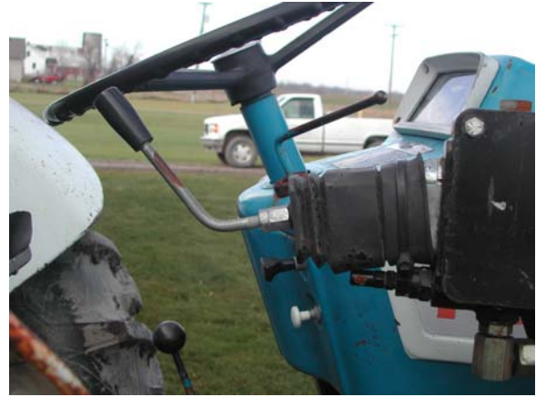
Figure 2. Joystick control operating front-end loader

The victim's wife stated that when the loader was used to transport haylage and hay for long distances, the victim routinely secured the hay bale inside of the bucket with a chain. But, when transporting the bales short distances, the victim did not routinely secure the hay bale with a chain in the bucket. Confirming the wife's statement, Figure 6 taken by the police at the time of the incident shows a loose chain hanging inside of the bucket. She also noted that the victim always traveled with the bucket low to the ground. On the day of the incident, the victim was transporting one four-foot by five-foot plastic-covered square haylage bale a short distance to his wife. His wife was standing by the buffalo pen using a pitchfork to feed the buffalo. She was finishing a bale that was used the day before while he drove the tractor to retrieve and transport the first bale to her.