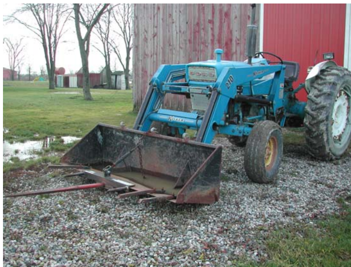
Figure 8. Bale spear attachment to loader bucket

Moving the bale with a tractor equipped with a front-end loader that did not have a grapple to secure the bale was a contributing cause of the fatal incident. The use of the front-end loader without a grapple as a means for handling the large square hay bale presented a hazard, particularly when the loader arms raised independently above the front end of the tractor. A front-end loader equipped with a grapple, designed for the task being performed by the operator would have provided a safe means for handling the hay with less risk to the operator. After the incident, the loader bucket was equipped with a bale spear. See Figure 8. The spear attachment is not normally designed nor intended for use