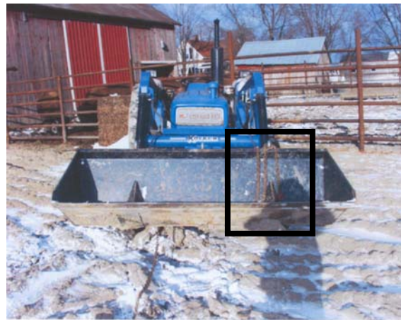
Figure 6. Moved tractor with bucket in semi-raised position and loose chain

The police found the tractor with the loader's arms elevated and moved the tractor to another location. They set the bucket a few feet off of the ground, turned the tractor off and took the keys. See Figure 6.