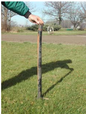
Figure 11. Loader's bent support stand

The loader was equipped with one self-storing stand (see Figures 11-13) that was designed to support the bucket during bucket quick disconnect. The support stand bent when the victim used it to support the loader crossbar while he was disconnecting the bucket. The MIFACE researchers do not know under what conditions (type of terrain, level/sloping, wet/dry, stand incline angle, etc) the support stand was used. The farm homestead land was fairly flat. Other Koyker front-end loader models have dual stands to support the loader crossbar during bucket disconnect. The manufacturer does not recommend the installation of the dual-support stand loader models on the victim's tractor model. MIFACE suggests that the equipment manufacturer reevaluate the design of the model of loader recommended for the victim's tractor to insure that the loader can be adequately supported by one support stand and if the current support stand material is strong enough to support the loader under all conditions of use.