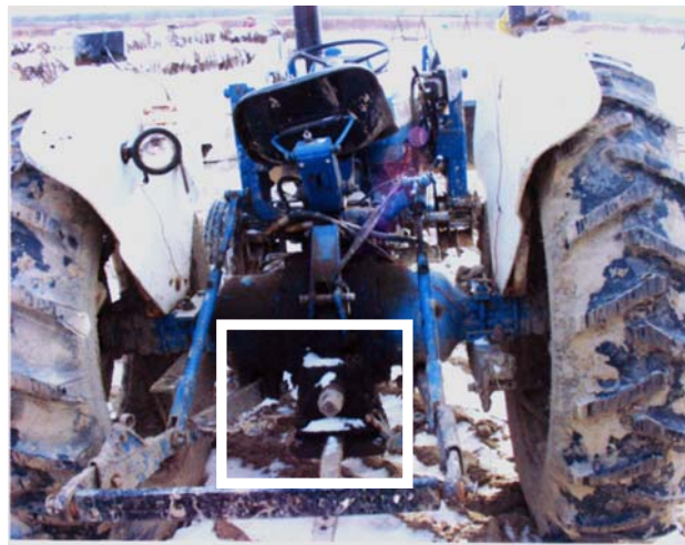
Figure 5. Bent steering wheel and tractor seat. Note unguarded tractor PTO stub

The victim attempted to free his stuck tractor. His wife stated she watched him rock the tractor back and forth. The victim's wife originally thought that the victim had raised the loader bucket over the hood of the tractor to change the tractor's center of gravity and "give the rear wheels more weight". During the rocking movement, the hay bale fell out of the elevated bucket and struck the victim on the right side of his head and chest. The 1500-pound bale bounced off of the victim and landed on the ground to the victim's left. The victim remained seated in the tractor with his hands on the steering wheel and his foot stuck under the brake pedal