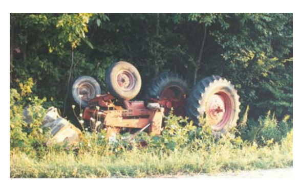
Figure 1 – Tractor overturn view from road

At approximately 6:00pm, he left his farm and drove the tractor on a paved, asphalt, 2-lane road with a narrow paved shoulder