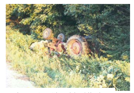
Figure 3 – Shoulder/ditch overgrowth