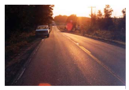
Figure 2 – View from hill crest

A passing motorist saw the overturned tractor and called 911. Emergency response arrived and the victim was declared dead at the scene.