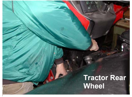
Figure 2 – Possible position of victim

While standing on the ground, the victim stood in front of one of the rear wheels, depressed the clutch, and turned the ignition key to the ON