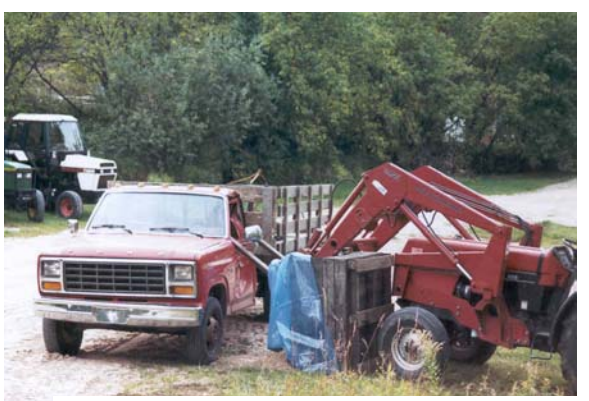
Figure 3 – Final resting spot of tractor

A fellow employee stopped by the pole barn and heard the victim cry for help. The employee called for emergency assistance and emergency responders took the victim to the hospital. The victim went into surgery to repair his pelvis. The next day, the victim developed a blood clot that traveled to his lungs causing his death.