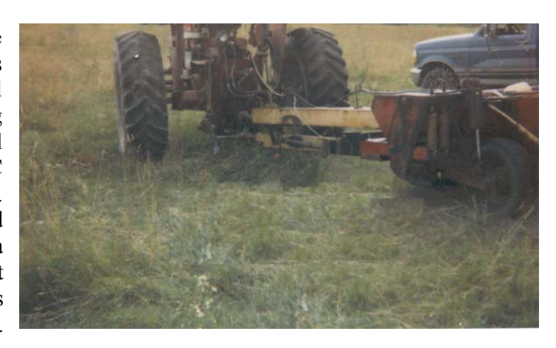
Figure 1. Incident scene

On July 17, 2003, a 73-year-old male cattle farmer was killed when he was pinned beneath the front of a flail He had been clipping mower. pastures on a Farmall International 706 fast hitch tractor with a MC rotary sythe (flail mower) attached. When moving from the field he had just cut, he placed the flail mower in a locked upright position. The next pasture he was going to cut was protected by a ribbon electric fence. He traveled along a two-track road, through a wooded area approached the field he was preparing