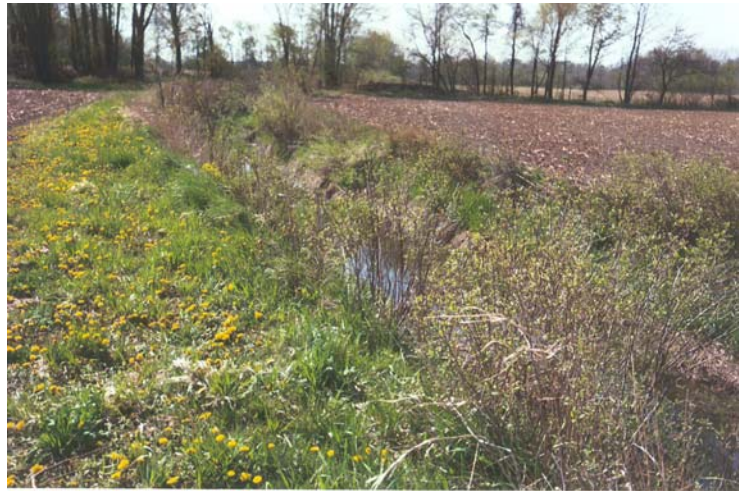
Figure 1. Access path/ditch leading to woodlot

On July 28, 2003, a 77-year-old male farmer was driving a 1954 77 Oliver tractor equipped with a front-end loader with 12-inch bucket tines to a woodlot on his property. He was carrying a salvage flail mower chained to the loader. The tractor was not equipped with a roll-over protection structure (ROPS). He traveled east along a lane between his cornfields to the back of his property and made a right turn (south) around a 10-foot deep by 15-foot wide drainage ditch. There was a variable width path to the wood area on the east side of the ditch (See Figure 1). It