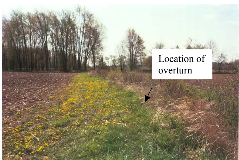
Figure 5. Mowed path to woodlot