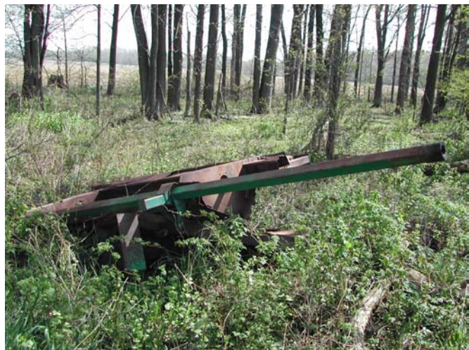
Figure 2. Salvage flail mower in woodlot

The victim had two flail choppers, one that he had salvaged for parts and one for use. Because of a fire on his property, he had lost the storage building for the choppers, and they were currently being stored where they could be seen behind the house. The victim wanted to move the salvage flail chopper to a remote location so that it would be out of sight. Therefore, he decided to take the salvage chopper to a woodlot at the rear of his property. MIFACE researchers measured the flail chopper dimensions during the visit; the chopper measured 17 feet 10 inches from front-to-back and seven feet wide.