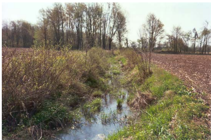
Figure 7. Undefined ditch edge

The outside row of corn was planted approximately six inches from the edge of the access path to the woodlot. This limited distance between the edge of the field and the path further narrowed