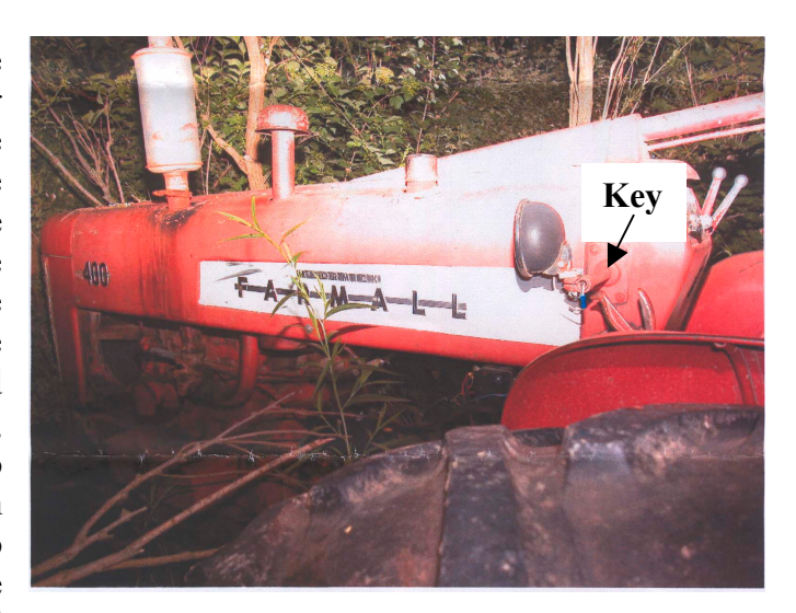
Figure 3. Farmall Tractor and key location

Scenario Six: The victim may have dismounted from the tractor to either retrieve his cell phone, ball cap, check the chopping equipment operation, or to use the shovel hanging on the wagon (See Figure 3) to redistribute the hay in the trailer wagon. It is unknown whether he dismounted with the tractor running. He did not set the parking brake. If he had turned the tractor off prior to dismounting, he may have left the tractor in gear. Prior to mounting the tractor and while standing on the ground, he may have turned the key to start the tractor. (See Figure 4) Since the tractor was in gear, it began its forward movement upon starting. He was unable to get out of the way and was run over by the tractor and chopper.