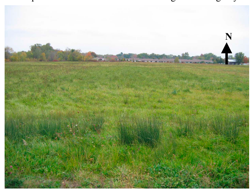
Figure 1. Rutted field where victim was cutting at time of incident.

both family and friends. He had to delay cutting and baling his client's fields due to wet weather. The family member interviewed stated he had been cutting hay for years and was very experienced operating the tractor and associated hav cutting equipment. On the day of the incident, according to this family member, he had returned home from his night shift work, and slept until around noon. He ate lunch, then visited a friend and borrowed his New Holland chopper to cut this field. The victim called the family member interviewed using his cell phone at approximately 3:00 p.m. while he was hooking