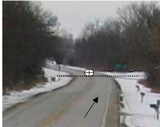
Figure 1. Location of decedent and southbound vehicle direction. Crossroad is dotted line

On June 22, 2006, a 47-year-old male surveyor for a county Road Commission was struck by an oncoming vehicle while conducting surveying operations in the middle of an intersection of a two-lane highway. He was wearing an orange high visibility vest. The two-person survey crew had not set up any road signage indicating that survey work was being conducted. The crew had not established a proper lane closure nor had they set up traffic cones around the area where he was standing, holding the prism pole. The decedent was holding the prism pole in the southbound lane when an oncoming vehicle traveling in the southbound lane struck him (Figure 1). The collision caused him to become airborne and he was struck again by a northbound vehicle. 911 was called and the decedent was declared dead at the scene. The driver of the southbound vehicle was driving on a revoked license due to “vision problems.”