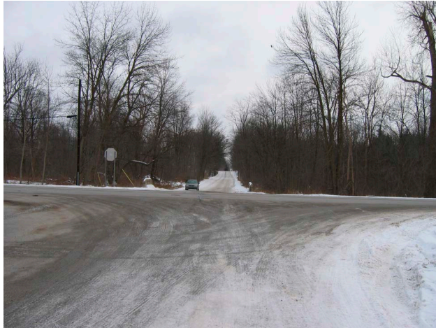
Figure 3. Intersection facing east on crossroad. Vehicle location in picture is the approximate location of decedent work vehicle.

After arriving at the worksite, the decedent and his coworker began to perform the survey activity. They did not set up road signage nor lane closures. At approximately 9:20 a.m., his coworker was positioned on the crossroad at the top of a hill approximately 1300 feet away from the highway. He was positioned in the “section line” 50 feet off the right of way approximately five feet north of the crossroad’s south edge. After his coworker was positioned, the decedent drove the work van to the highway/crossroad intersection. He parked the work van on the crossroad east of the highway. (Figure 3)