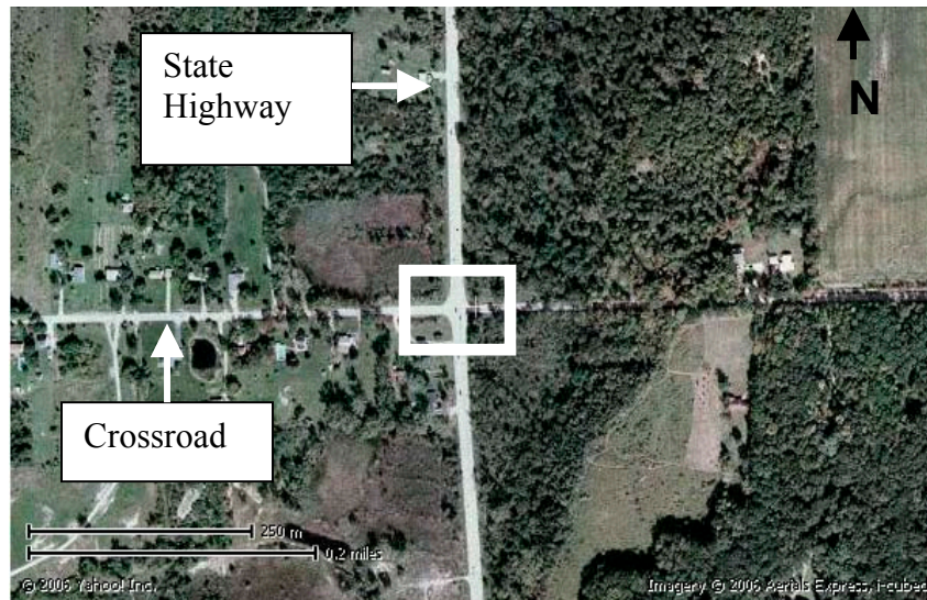
Figure 2. Satellite view of incident scene.

They arrived at the incident site at approximately 9:00 a.m. (Figure 2). Both workers were wearing orange reflective vests. The coworker stated that they had placed traffic cones on the intersecting street but not on the highway.