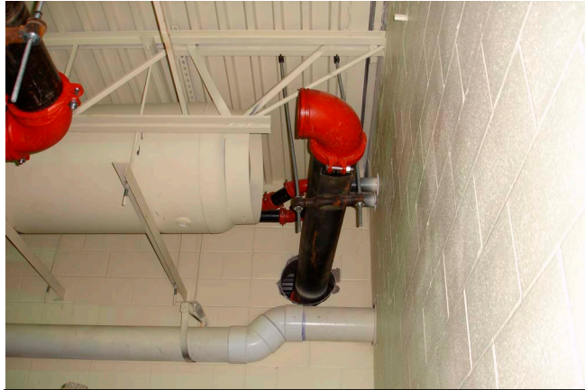
Figure 3. Pipe and elbow involved in the incident

decedent stated to his coworkers that he was going to configure the run for the 8-inch pipe that was located approximately 12 feet from the floor. At the end of the 8-inch line was a vic fitting end cap that had to be removed. The cap that was used is also known as a groove lock cap, or gasketed end cap. These names describe a method of isolating a pipe that consists of bolting a coupling with a gasket in which the cap or plug is seated onto the end of the pipe by a two-piece clamp with a nut and bolt on each side. The incident occurred while the decedent was removing the 25-pound vic fitting end cap from the 8-inch pipe. While loosening the cap clamp, the cap blew off the end of the pipe, striking the decedent in the neck and upper chest area. It is unclear from the photos if the decedent was straddling a 10-foot ladder, standing on the top step of the ladder, or standing on top of the boiler, which was close to the capped pipe. It is also unclear if the decedent was directly in line with the end cap or if the cap blew off at an angle other than parallel with the direction of the pipe run.