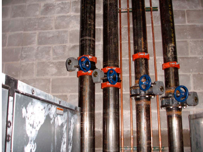
Figure 2. Valves in lines in Second Floor Mechanical Room

After repairs were made, the line was recharged, and the field foreman for the decedent’s employer and the construction manager for the project completed a test report to verify that the lines were free of leaks. After the construction manager signed off on the form that the lines passed inspection, the field foreman told the decedent to release the pressure off all the piping. Air was released from the pipes, except for a portion of line “downstream” of the closed valve. This section of line was left pressurized to 80 psi. The reason for this is unclear. Pressure was released in the Boiler room, and the gauges that had been set up in the Boiler room read zero. It appears that after the successful pressure testing of the piping, the decedent did not go back to the second floor Mechanical room to open the valve that he had closed.