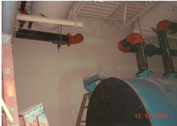
Figure 1. Incident scene

On December 13, 2006, a 41-year-old male plumber/pipefitter died when he was struck in the chest by a pipe cap that he was removing from a pressurized pipe. Some leaks had been identified in an 8-inch waterline that had been previously installed and which needed to be repaired. To aid in troubleshooting the leak locations, valves were closed off in the lines, creating sectionalized portions of air charged waterline. The waterline was pressurized to 80 psi. After pipe repair was completed, the air was released from the lines, except for a portion