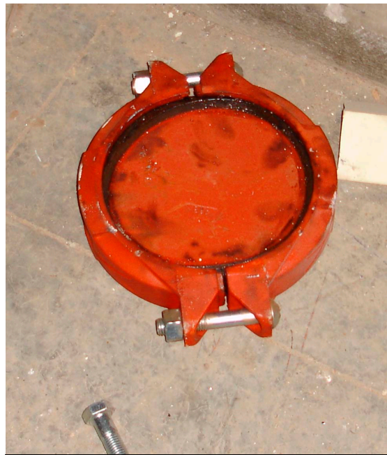
Figure 4. End cap that struck decedent

None of the coworkers in the Boiler room actually saw the incident occur. Hearing a noise, they moved from their work area and found the decedent on the floor approximately 15-20 feet away from the end of the pipe. The end cap was found on the floor approximately seven feet from the decedent. The wrench the decedent was using to loosen the clamp was found caught between the boiler and its associated piping. One of the coworkers called 911. Emergency response arrived and transported the decedent to a local hospital where he died.