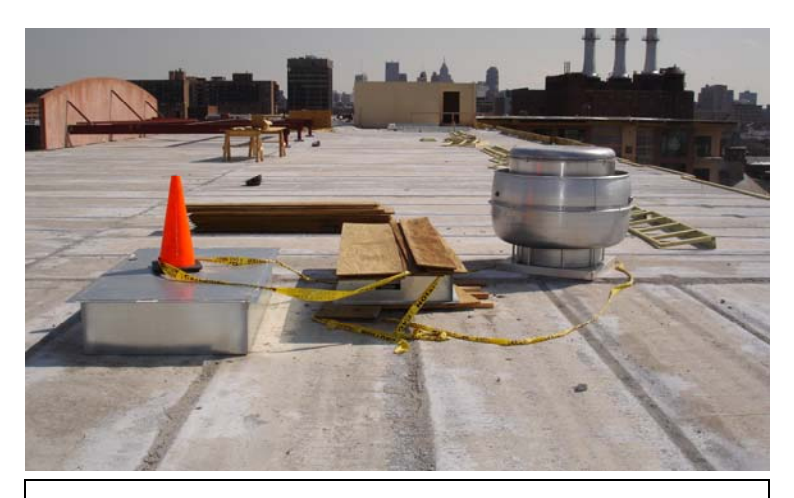
Figure 1. Make-up air roof curb with orange pylon, exhaust fan roof curb with plywood, looking south on roof

In the winter of 2008, a 19year-old male construction worker fell from the roof of a five-story building through a 26-inch by 24-inch make-up air opening of an elevator shaft (chase) to the concrete of floor the basement. Another contractor had placed a metal roof curb measuring 72 3/4-inches long by 40 3/4-inches wide by 14inches high over the make-up air opening, but did not secure it to the roof. There was no marking either on the roof or the roof curb