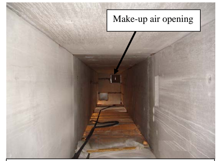
Figure 8. Chase A openings as seen from the basement, facing east

The company owner ran to the side of the roof to see if the decedent fell from the roof edge. When he did not see him, the company owner ran north toward Chase A. At the make-up air roof opening, he found the decedent's hard hat approximately two to three feet north of the opening. He looked down the opening and saw the decedent approximately 69 feet below at the bottom of shaft, which was 7 feet 11 inches long north to south by 6 feet 3 inches wide east to west. The Figure 8 shows the exhaust air