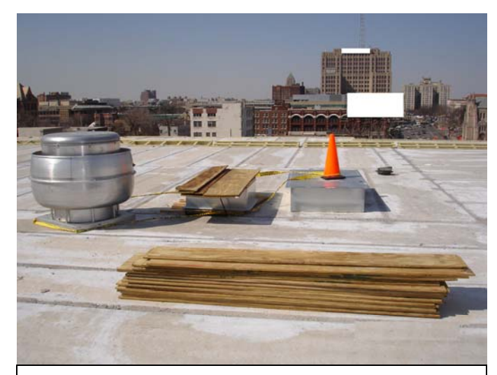
Figure 7. Make-up air roof curb with orange pylon, exhaust fan roof curb with plywood, looking north on roof

picking up the tools that something was needed to secure the approximately three-foot high stacked plywood. He stated he usually would use straps to secure loose plywood. The decedent's coworker was walking south toward the stairwell carrying tools to be placed in the fifth floor gang box. The company owner was approximately 30 feet behind him, also carrying equipment (Figure 1). The coworker was nearly at the roof stairs. The company owner was talking to the decedent who he thought was behind him and when the decedent did not respond, he turned around and did not see the decedent on the roof.