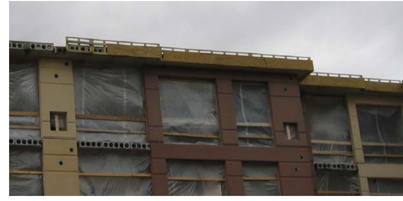
Figure 6. Example of parapet work construction

was under the impression given to him by the company owner and other workers at the site that he "didn't need to tie off unless he was within 10 feet of the roof edge". The company owner instructed him on his first day on the roof on how to use the harness, lanyard and rope lifeline. The coworker stated he would tie off if he approached the roof's edge.