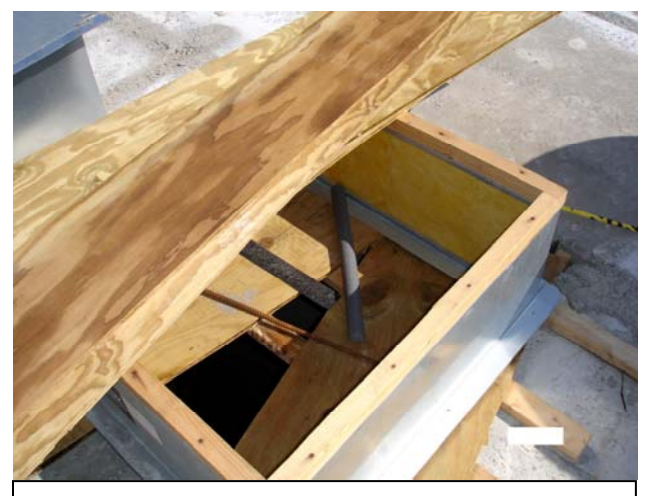
Figure 4. Chase A exhaust fan hole with 2x4 lumber and plywood boards as cover

At Chase A, Contractor C cut the exhaust fan and make-up air openings. Contractor D stated he did not secure the roof curbs at both the exhaust fan and make-up air openings. He placed the make-up air roof curb upside down to prevent the insulation from getting wet. The exhaust fan roof opening