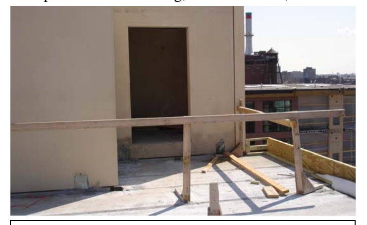
Figure 2. Guardrails at stairwell opening

Guardrail system on the roof of the 5<sup>th</sup> floor is loose and exceeds 9 feet 3 inches between posts along the west side of the building.