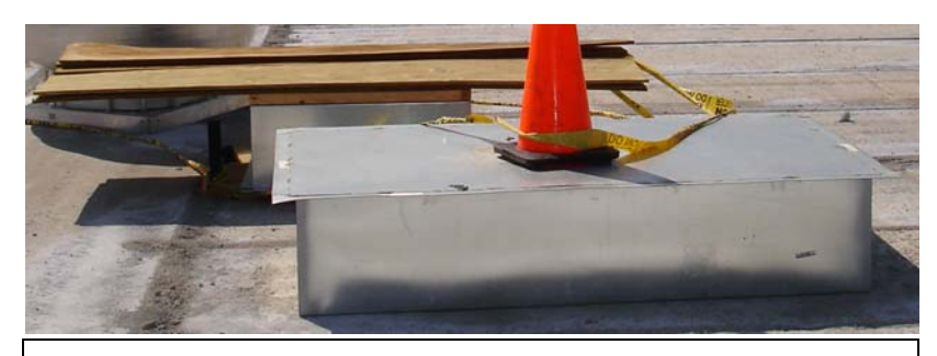
Figure 5. Close-up view of make-up air roof curb with cone, exhaust fan roof curb with plywood, looking west

The decedent was a member of a three-person crew, consisting of the company owner who was acting as foreman, the decedent, and another coworker. A foreman from Contractor B showed