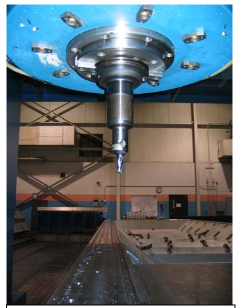
Figure 1. Cutting head of vertical gantry mill and part being machined

At some point during the head movement, the decedent came into contact with the rotating head and his body was drawn into the cutting head. The decedent's activities leading to the event were unwitnessed. Possible activity scenarios include: a)