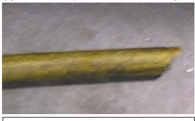
Figure 2. Picture of severed air hose

A severed air hose used to blow chips from the part was found west of the part on the track floor (Figure 2). The night shift operator postulated that the hose may have been positioned around the decedent and the hose was caught