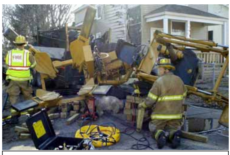
Figure 1. Position of decedent under passenger side rear tire of tree spade attachment

In the winter of 2009, a 30vear-old male construction laborer was pinned under the tire of articulating an DitchMaster M450 with a front end loader and tree spade attachment that overturned to side. The decedent's the employer had parked the machine, placing the front end loader attachment across a construction trailer tongue and its 2-foot crank hitch with the driver's side front tire against trailer tongue. The the decedent and two coworkers