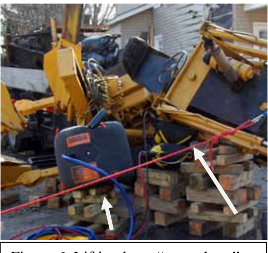
Figure 6. Lifting bags "maxed out"

Many pieces of construction equipment are heavier than an automobile. Thus, it is important that the lifting and stabilization plan take into account that the routine extrication tools utilized by the fire department personnel not be "maxed out" during a rescue, or exceed the load rating of the tool (Figures 6 and 7). Because of the weight of the construction equipment, the amount of extrication force that must be applied is increased. These higher forces increase the likelihood of rescue tool failure and slippage or equipment damage. The failure or slippage of the rescue tool or the damage to the acuinment can be disastrous to an