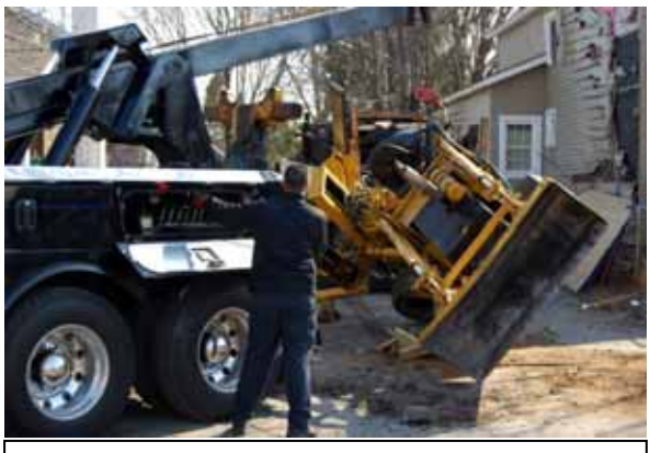
Figure 8. Use of heavy duty tow truck to upright DitchMaster

resources needed to augment existing capabilities for technical search and rescue incidents and shall maintain a list of these resources, which shall be updated at least once per year." Especially when extricating an individual from under construction equipment, utilizing heavy duty wreckers or truck cranes, which have experience in conducting vertical lifts and moving equipment, and which can respond quickly, can assist the responding fire department to safely extricate the individual, and perhaps save time in doing so (Figure 8). The responding fire