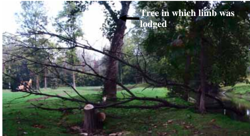
Figure 1. Overview of incident scene, facing north

The decedent and his coworker were in the process of removing eight dead ash trees on the course. The incident ash tree was assessed and damage noted approximately 36 feet above the ground. Additionally, one of the ash tree's limbs was