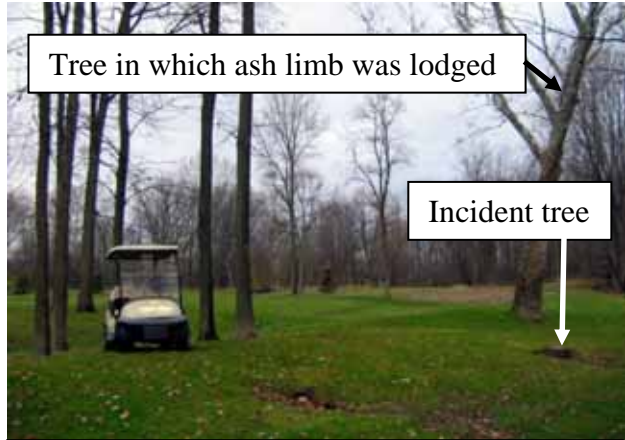
Figure 4. Golf cart shows location of decedent's first retreat into stand of trees

The decedent retreated to the north as the tree began to fall. Apparent interference from the adjacent tree to the north in which the falling tree's limb was lodged resulted in the ash tree