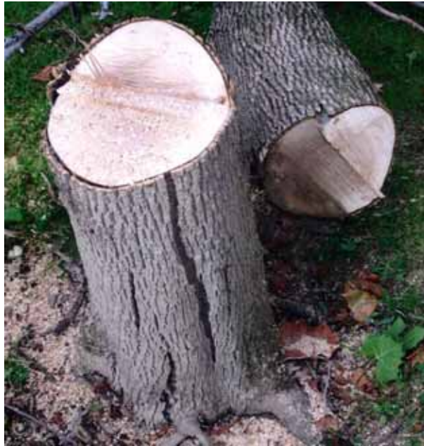
Figure 3. Felling technique of incident tree

desired path). The area where he retreated to is identified in Figure 4 as the stand of trees where the golf cart is located. The tree stopped falling. The decedent returned to the tree and made an additional horizontal cut from the south into the existing hinge wood leaving approximately 1/4-inch of hinge wood.