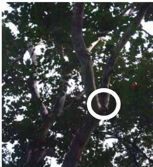
Figure 2. Tree in which incident tree limb was wedged.

The decedent retreated to a point west of the tree approximately 24 feet away between some standing trees as the tree began to fall to the south (its