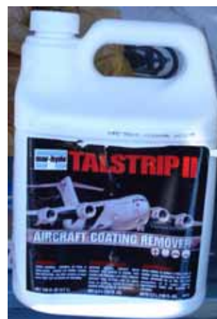
Figure 5. Container of Tal-Strip® II used by decedent