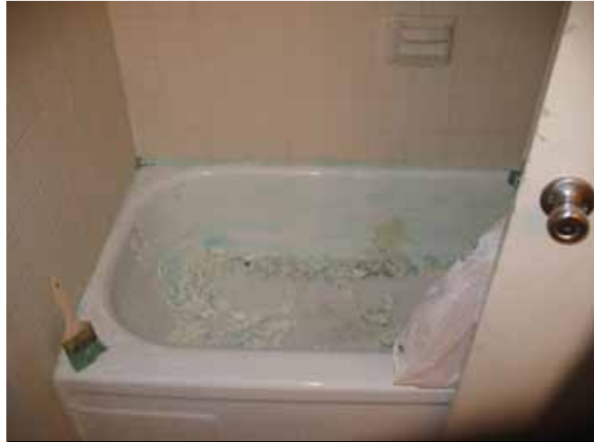
Figure 1. Incident bathtub, brush used to spread product and location and swing of bathroom door

In the winter of 2010, a 52-year-old male tub re-glazer died due to overexposure to methylene chloride (MC) vapor while stripping a bathtub in an apartment bathroom using Tal-Strip® II Aircraft Coating Remover (Tal-Strip® II). Methylene chloride was the primary ingredient of the aircraft-grade Tal-Strip® II (60%-100%). The work process involved pouring Tal-Strip® II directly from the container onto the tub surface and using a 4-inch paintbrush to spread the product. At approximately 9:30 a.m., the decedent arrived at the apartment complex. At approximately 11:10 a.m., one of the apartment maintenance personnel attempted to contact the