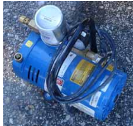
Figure 4. Air pump that supplied breathing air to the supplied air respirator system