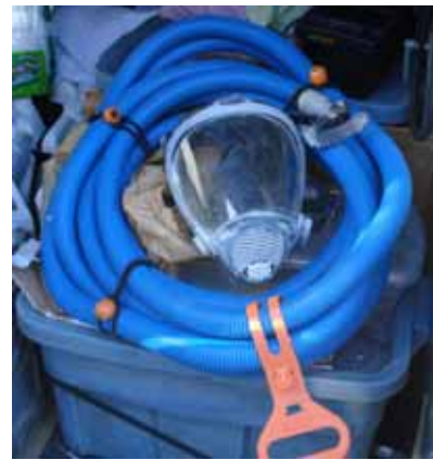
Figure 3. Full-face air supplied respirator