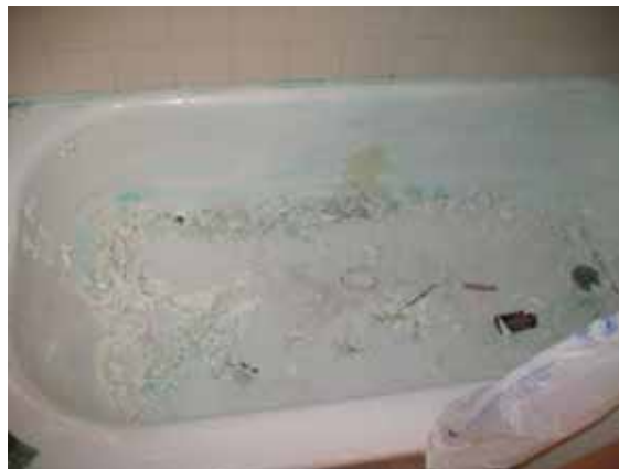
Figure 8. Amount of work completed by decedent when found by maintenance

Maintenance #2 was instructed to inform the property manager of the situation. After speaking with the property manager, he then went to the apartment where the incident occurred. The workers pushed open the bathroom door, and Maintenance #2 checked for a pulse and airway blockage. The decedent was sweaty and cold to the touch. The workers pulled the decedent from the bathtub and laid him on the bathroom floor. Maintenance #2, who indicated in the police report that he was a certified EMT, began chest compressions. Emergency response arrived and pulled the deceased from the bathroom into the living room to continue resuscitative efforts.