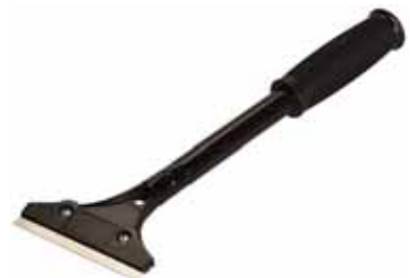
Figure 9. Example of long-handled scraper

As an example, refinishers should purchase/modify the paintbrush (if used) and scraper. The decedent’s work practice was to utilize a 4-inch paintbrush with a standard-sized handle (Figure 1). Employers/workers should consider adding an extender to the tool or purchase tools with longer 12-inch handles to minimize the worker’s exposure by reducing the bending/leaning into the tub. An example tool is shown in Figure 9