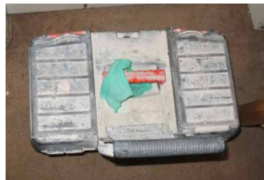
Figure 7. Type of glove worn by decedent