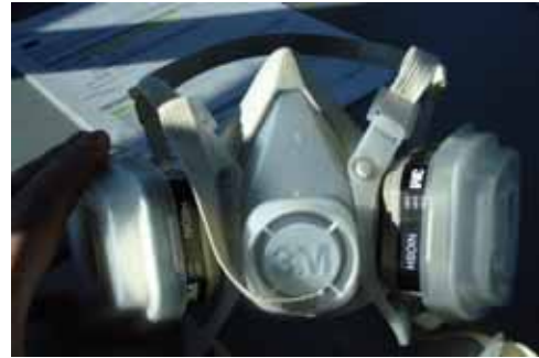
Figure 2. Air purifying, half-face piece respirator with cartridges

Figures 2-4 show the respirators and associated equipment owned by the owner MIFACE spoke with during the on-site interview. Both full-face, supplied air respirators (SARs) and half-mask respirators equipped with organic vapor cartridges were purchased and, the owner noted, should have been available for use depending upon the job parameters.