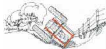
Figure 3. ROPS/Seatbelt providing zone of protection

Tractor rollovers are likely to occur on hilly terrain when the center of gravity on the tractor becomes unbalanced. The field slope, tractor speed, turning radius, rear axle torque and center of gravity are all interrelated factors that impact the stability of a tractor. ROPS are designed to help limit a tractor overturn to 90 degrees and to provide the operator a “zone of protection” (Figure 3). The operator stays within this zone only if they also wear the seat belt. The operator will not be protected by the ROPS during an overturn if the operator is not wearing a seatbelt since the operator may be totally or partially thrown off the tractor. Even inside a cab, seat belts are important to keep the operator from being thrown against the frame, through a window, or out a door. Therefore, when an older tractor is retrofitted with a ROPS, approved seatbelts must also be installed. Seat belts may not be included with an available ROPS package and will have to be purchased separately.