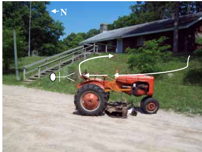
Figure 1. Overview of incident scene showing mowing path and position of decedent on hill. Tractor had been removed from decedent by emergency response.

In the Summer of 2010, a male volunteer in his 70s was killed while mowing grass for a youth organization's camp using a tricycle-type Allis Chalmers Model L59AC farm tractor, retrofitted with an after-market, home-installed underbelly power rotary mower attachment. The tractor overturned to the side on an approximately 30-degree hill and pinned him beneath it. The tractor was not equipped with a rollover protection structure (ROPS) and seat belt (Figure 1). The decedent had mowed the property for over 30 years. The following scenario has been