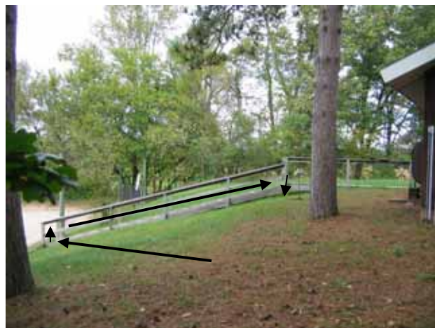
Figure 2. At top of hill, facing north looking through two trees near the building.

The camp was located at the end of a road on the east side of a cul-de-sac. The camp building was five feet away from the nearest tree. There was 16 feet 6 inches between the two trees shown in Figure 2. The ground was fairly level approximately 16 feet from the building and then the slope of the hill commenced. The hill undulates and there was a knoll approximately 10 to 12 feet from the edge of the road. The decedent had mowed this property for over 30 years.