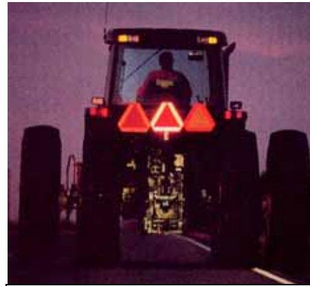
Figure 5. Center SMV emblem equipped with ASAE 276.6 recommendations

The new SMV emblems have fluorescent material aiding daytime visibility and reflective material aiding nighttime visibility (Figure 5). Replacing worn SMV emblems is important because the orange fluorescent center portion of the SMV emblem fades and turns color over time, changing from orange to yellow, pink or white. This portion is the most vulnerable to light and moisture degradation because fluorescent dyes decompose.