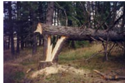
Figure 2. Picture of a tree barber-chair.

The decedent walked to the tree’s location. Using a chainsaw to fell the tree, the decedent made a horizontal 6-inch cut approximately 3 feet up from the ground to the top part of the tree. He did not make a cut to the underside of the tree. The tree barber-chaired at the location of the cut. A barber-chair is the splitting of the butt of the log during the latter part of the fall.