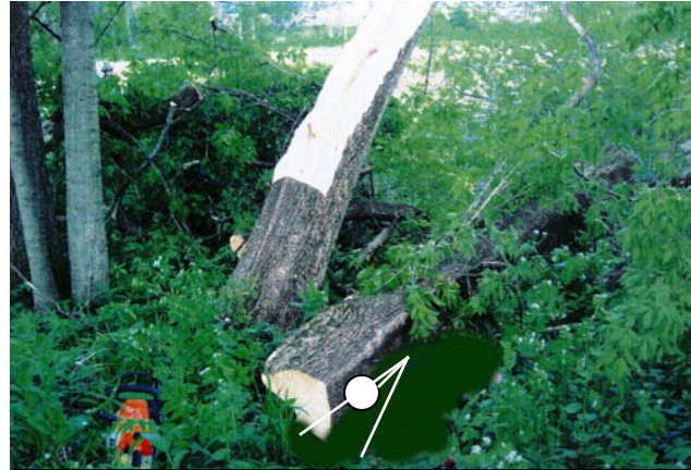
Figure 1. Incident scene showing tree that barber-chaired and location of decedent.

In winter 2012 a male handyman in his late 50s died when a 3-4 foot diameter box elder tree growing at a 45-degree angle “barber-chaired”, and the vertically split section broke away from the tree and struck him. The decedent had been hired by a farmer to cut down the tree because it was growing over and into the field. Using a chainsaw to fell the tree, the decedent made a horizontal 6-inch cut approximately 3 feet up from the ground. The tree split vertically at the location of the cut to the top part of the tree. The split piece came away from the tree, striking the decedent. The