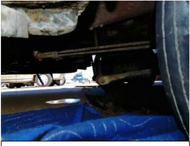
Figure 1. Picture of sway bar/linkage, passenger side, decedent's work area

In fall 2013, a male truck mechanic in his 40s died when a pickup truck fell on him. The decedent was in the process of checking the truck for an oil leak. The truck had been driven up a slight incline and parked with the front wheels on a cement apron surrounding a building. The front wheels were positioned several inches east of a 5-inch deep trench and the back wheels on dirt in a concaveshaped 3-inch trench. There was a consistent elevation decline from the building to the west to allow for water drainage. The decedent started the truck, placed it in neutral, and partially depressed the parking