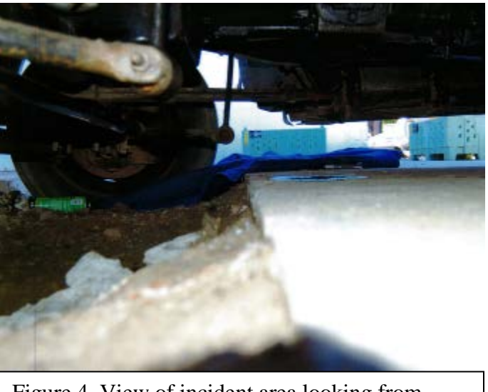
Figure 4. View of incident area looking from driver's side.

walked out of the door to investigate. Seeing nothing, they returned inside of the store. At approximately 10:30 am, an auto parts store employee exited through the side door and noted the truck running. The auto parts store employee returned at approximately 11:30 a.m., and again noted the truck was running. He looked under the truck and saw the decedent lying on his back with the truck's sway bar and linkage on his chest. He screamed for the decedent's friend, who came running. Emergency response was summoned. The decedent's friend used a jack to raise the truck up from the decedent. Emergency response personnel