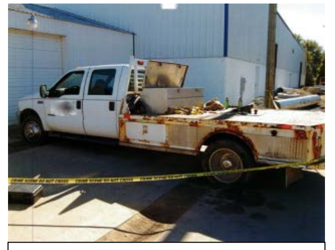
Figure 2. Truck involved in incident. Truck facing east, front wheels in trench

The decedent, according to his friend, had