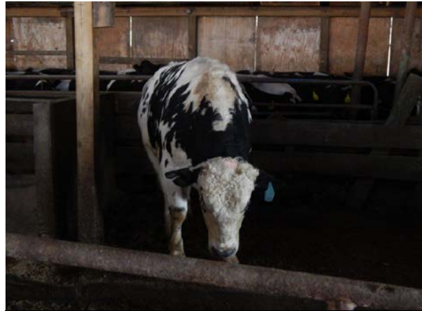
Figure 1. Bull which may have been involved in the incident

In spring 2014, a dairy farm worker in her 40s was mauled by either a 2-year-old bull or a dairy cow. The farm worker was herding approximately 50-60 dairy cows from a freestall area (where the cows eat and stay when not being milked) into a holding pen before they enter the parlor for milking. The bull had been raised by the owner's family on the farm and freely roamed with the dairy cows. The event was unwitnessed. The owners of the farm and a family member were in the front of the barn; one of the owners was tending to a sick cow and the other owner and family member were in the break area when they heard the cows bellowing. The three of them stepped