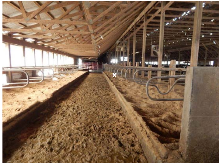
Figure 2. Freestall barn area leading to dairy milking parlor

The incident occurred at approximately 2:00 p.m. At the time, the dairy used a de-horned natural service bull to impregnate the cows. The owner indicated that since not all cows conceive with (take to) artificial insemination they have one bull that roams with the cows. The 2-year-old bull had been hand-raised by the family and their farm workers. The owner indicated the bull had never shown any aggressive behaviors toward the owner’s family or the hired farm workers. The bull was allowed to routinely mix with the cows, both outside and inside of the barn.