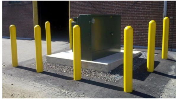
Figure 6. Example of bollard use.

MIFACE recommends that farm operations identify “lanes of travel” and install barriers to protect vital assets, such as buildings, storage units, etc. from damage. One low cost method of barrier protection is a bollard, which is a sturdy, short, vertical steel post that creates a protective perimeter to what is being protected (See Figure 6).