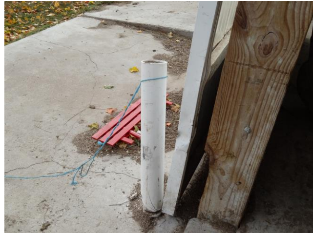
Figure 4. Damaged barn frame and bumper post

For reasons unknown, while the decedent was shoveling the second load of manure into the spreader, something startled one or both of the horses. The family member hypothesized that something specifically startled the younger horse. Both horses bolted of the barn. The young horse pulled to the right (south) causing damage to the barn frame and the bumper post next to the barn access (See Figure 4). Both damage sites had manure on them. Both horses and the trailing manure spreader continued to run south around the concrete pad with the unsecured grain bin. It is unclear whether the experienced horse, manure spreader or both the horse and manure spreader struck the northeast leg of the grain bin. At some point, the bin began to collapse in a southeast direction.