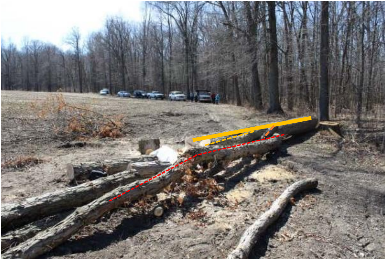
Photo 2. Incident scene, looking south. Solid yellow line is primary trunk of tree. Dotted yellow line is limb striking decedent. Red dotted line is limb that was laying on the ground. Orange dotted line is supporting limb. Trunk and other limb were oriented above the limb laying on the ground.

The decedent was very familiar with using a chainsaw to clear trees. Over the years, the decedent had cleared many acres of woods with a chain saw.