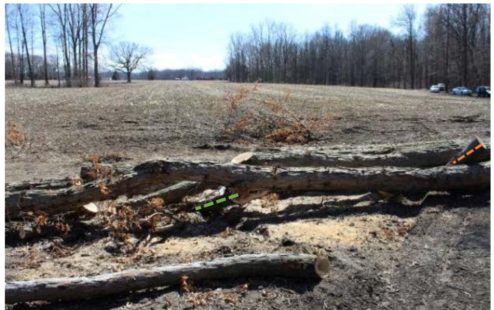
Photo 5. Looking south. Orange dotted line shows limb supporting tree. Green dotted line shows another supporting branch which broke away from the tree when it rolled to the south.