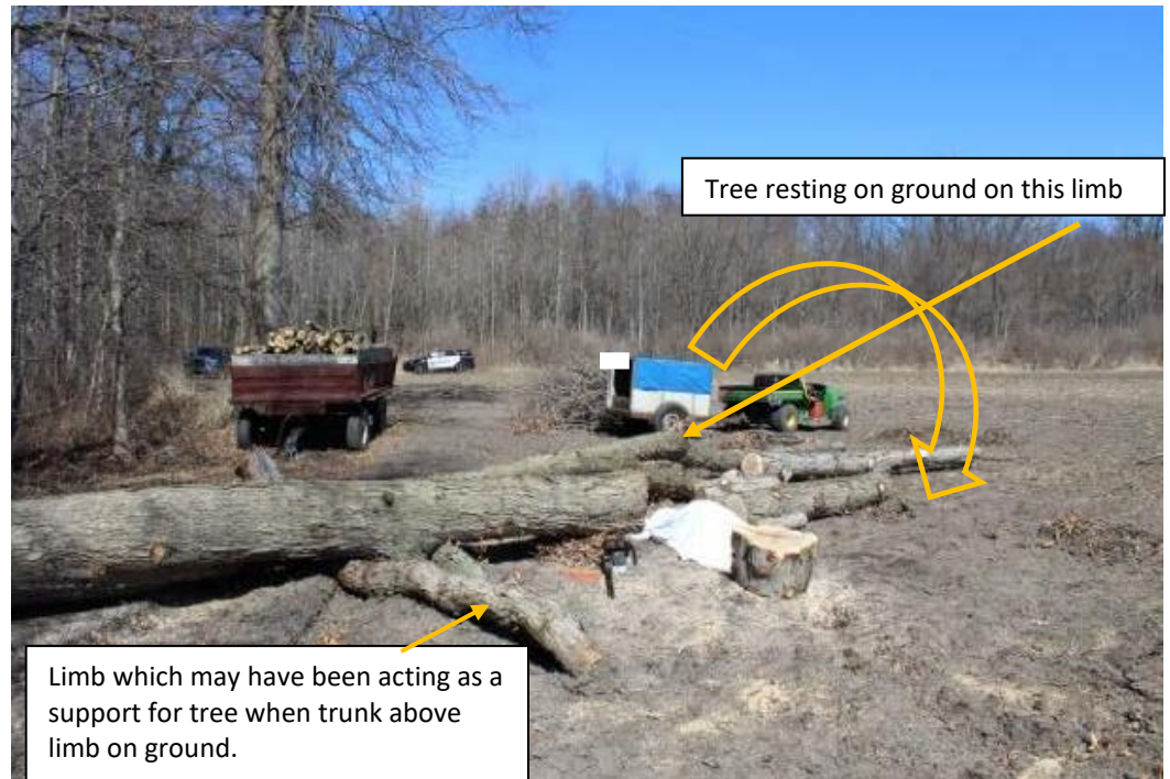
Photo 4. Incident scene looking north. Curved arrow shows direction of tree rotation, limb upon which tree was balanced.

She drove back home. She picked up her cell phone and then got into