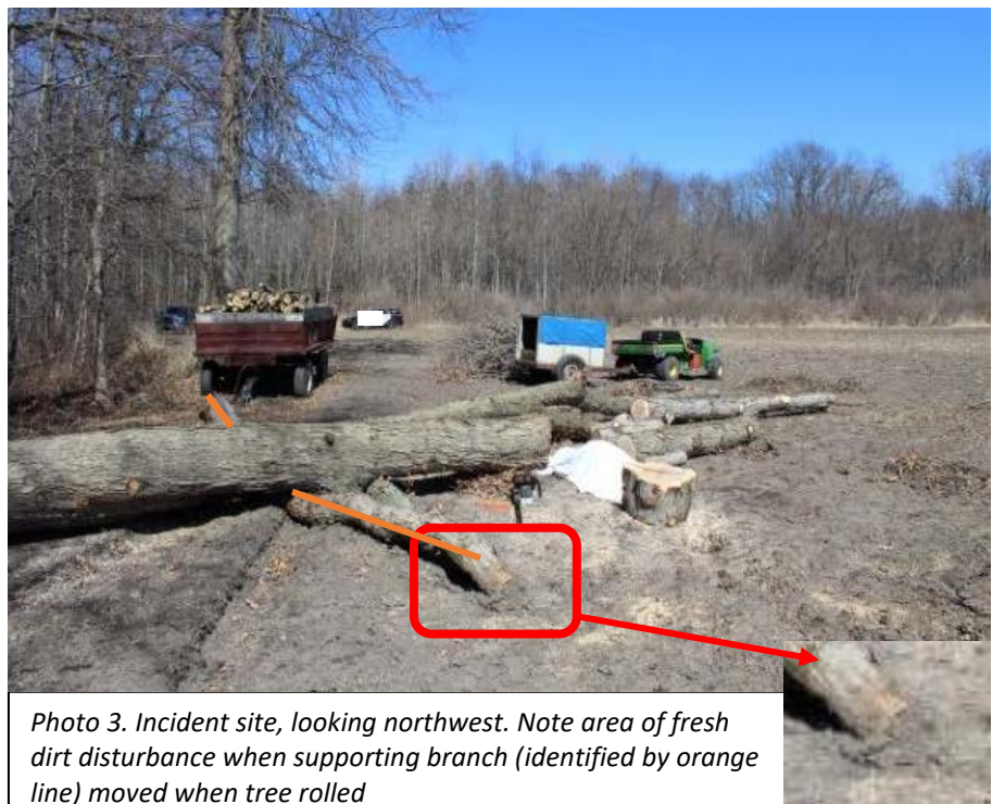
Photo 3. Incident site, looking northwest. Note area of fresh dirt disturbance when supporting branch (identified by orange line) moved when tree rolled

At an unknown date after the tree had been felled, the decedent and his son went to the site to trim some limbs and branches. While trimming, the tree shifted, and his son told his father not to go out alone to cut the tree. The tree had been down nearly one month and