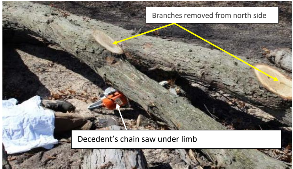
Photo 6. Close view of chainsaw location under limbs and branches removed when working from north side

We hypothesize the primary trunk was above the location of the chain saw and that he was cutting branches that he believed would cause the tree to roll toward the north. When the cut began, the load release of the tree top cut in combination with hanging on the stump did not