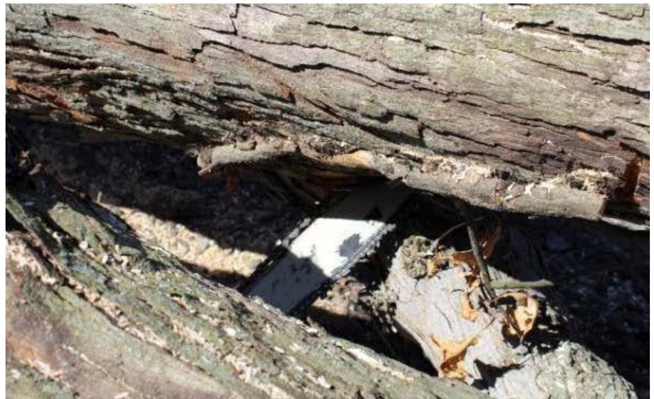
Photo 7. Chainsaw blade near freshly cut limb