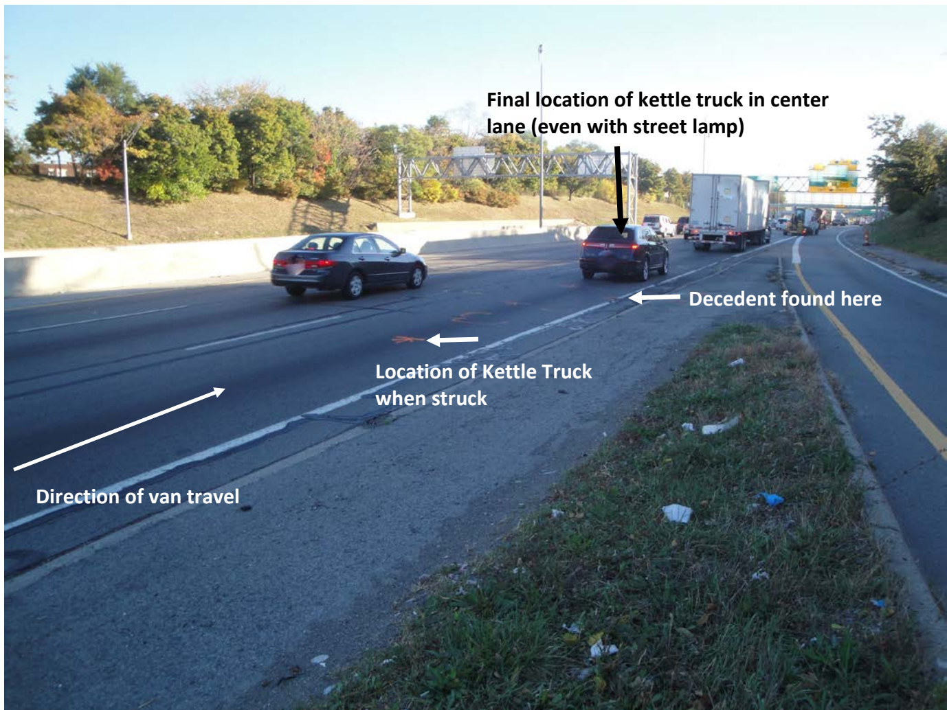
Photo 4. Close up of gore area of entrance ramp #3 where incident took place

After the impact, the decedent's coworker landed between the center and right lanes, approximately 4 feet behind the driver's side rear of the van with a broken left leg and related cuts/lacerations (Photo 4). The coworker was transported to a local hospital by emergency responders and survived.