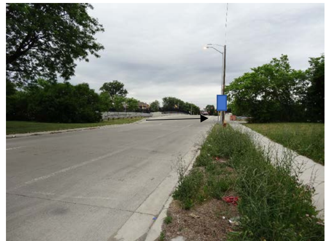
Photo 1. Visual sight lines to entrance ramp #2. Arrow shows ramp #2 entrance

In the direction in which the work crew was working, there were four expressway entrance ramps within the 2-mile long work zone (See Figure 1). The responding police accident investigator stated to the MIOSHA compliance officer that both ramps #1 and #2 had barricades erected; the accident investigator had to drive around the barricades at ramp #2. Sight lines to the entrance ramp #2 were unobstructed (Photo 1). After entering the expressway, the roadway curved (Photo 2).