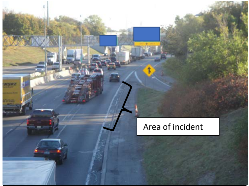
Photo 3. Overview of Incident site. View of expressway just east of entrance ramp #3.

As a result of the impact, the kettle truck was moved forward approximately 140 feet to the east from where it was parked and into the center lane. The van moved to the east from the impact point remaining in the right lane and came to rest approximately 30 feet from the impact point.