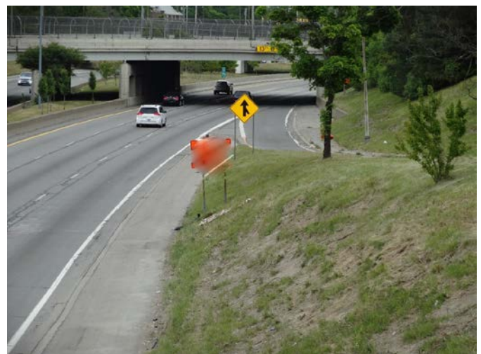
Photo 2. View of entrance ramp #2 from overpass. Note roadway curvature.