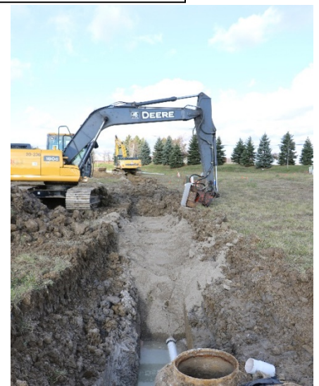
Figure 2. Water location in trench