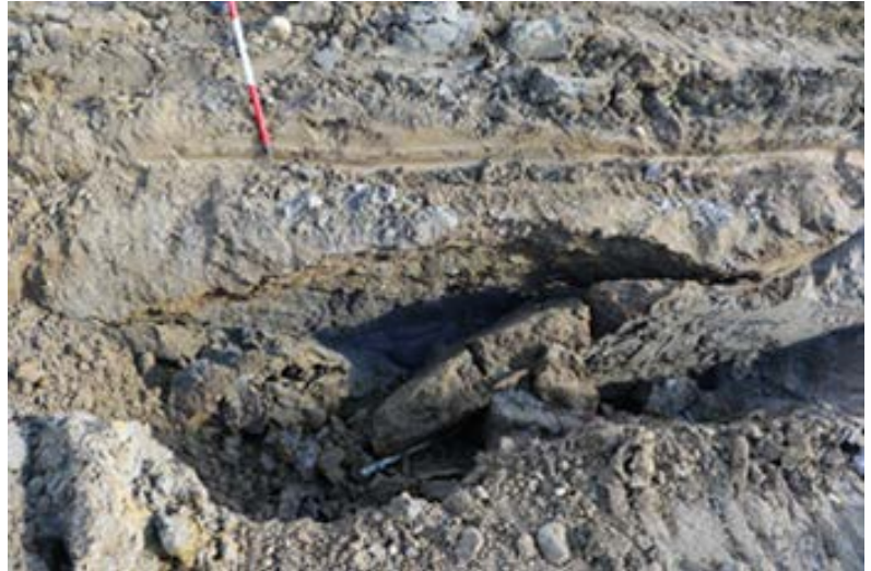
Figure 3. Trench wall collapse