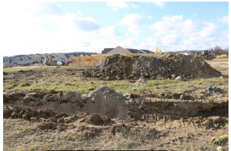
Figure 1. Placement of spoils