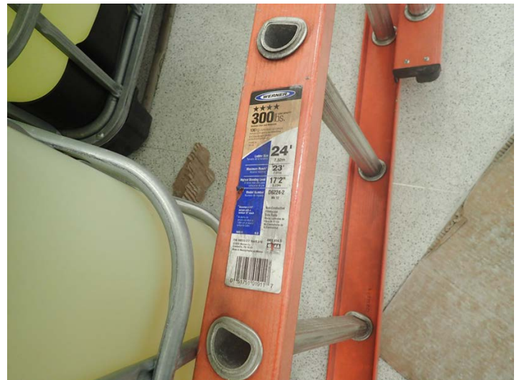
Photo 1. Ladder used by decedent

See Drawing 1 on Page 12 for an overview of the incident scene.