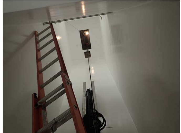
Photo 5. View of shaft way looking up from the ground floor.

The top guardrail was re-installed after the incident and was wedge-fit into shaft way opening with cardboard, protecting the wall areas from scratching. The ladder also appeared damaged from possibly striking the top of the installed lift equipment.