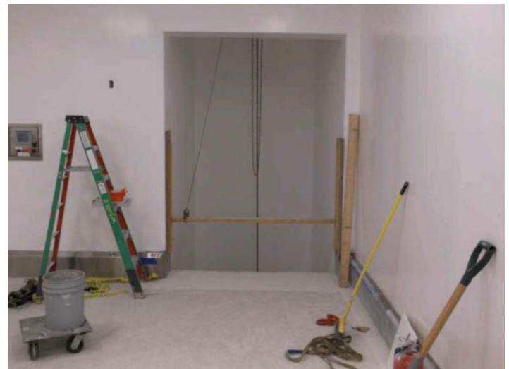
Photo 2. Lifeline attached to midrail at time of incident

On the day prior to the incident, the work crew prepared the work area and installed two sections of the stationary lift equipment. The crew installed the chain fall and fastened it to a steel beam located above the second floor ceiling in the center of the shaft way. The crew also installed the personal fall protection system to the same beam.