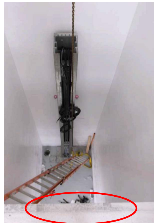
Photo 4. View of shaft way from second floor. Red circle locates the ladder feet marks on the edge of the shaft way