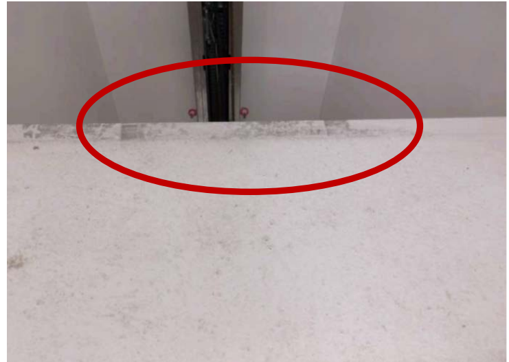
Photo 3. Ladder marks on edge of second floor

A painter from another firm was doing work at the first floor when the decedent fell. He heard the ladder falling and saw the decedent fall almost head first at the 1st floor level. He started first aid, including rescue breathing and chest compressions until the first responders from the manufacturing facility arrived and took over.