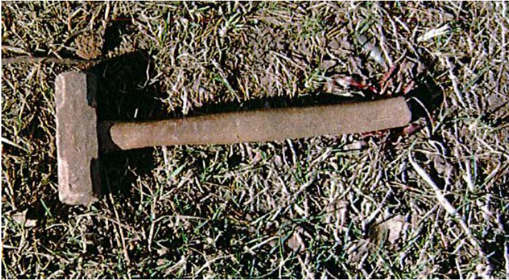
Photo 1. Small sledge hammer used by decedent

Michigan State University Department of Medicine • Occupational and Environmental Medicine 909 Fee Road, 117 West Fee Hall • East Lansing, MI 48824 • 1-517-353-1846 • https://oem.msu.edu