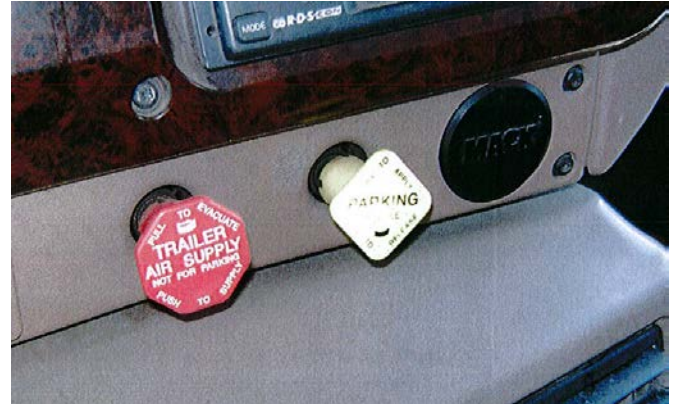
Photo 2. Example of position of Parking Brake when set

(north). The truck felt sluggish. When Coworker A looked in the mirrors, he noticed one of the wheels was frozen, the brake was stuck on the driver's side rear drive axle, and the tire was dragging. He kept moving because sometimes the wheel freed itself as it was rolling. The brake did not release so he rocked the truck back and forth several times. The brake freed from the drum.