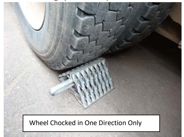
Wheel Chocked in One Direction Only

Coworker A retrieved the sledge hammer and headed back to the dump truck when he realized he didn't know what was "tapped" on to unstick the brake. Coworker A noticed that the decedent, who had finished his shift, was still at the yard. Coworker A walked to the employee breakroom. The decedent was in the breakroom with three other individuals - the city manager, a department of public works "lead man" and another employee. Coworker A asked the decedent for help to release the brake because of his prior working relationship with the decedent and the decedent's experience in driving trucks. The city manager heard the conversation between the two men and saw them go out carrying the small sledge hammer.