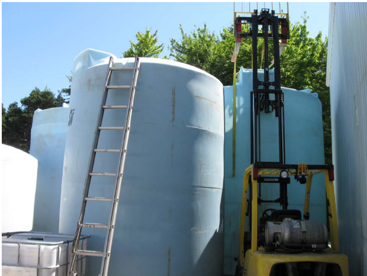
Figure 3: Tank 1 with ladder and hi-lo and straps positioned for entry at incident tank.

Soon afterwards, he observed the decedent gathering items to enter the tank so that he could rotate the intake valve to remove more of the residual mixture. The decedent had donned fishing-type waders and a 3M 6800 full-face respirator with ammonia cartridges. The decedent had also positioned a hi-lo truck adjacent to the tank, attached two ratcheting cargo straps to the mast of the lift, draped them over the forks, and suspended them through the unlocked 15"-diameter opening in the top of the tank (Figure 3). The decedent climbed the ladder leaning against Tank 1 and then walked across the top of Tank 1 to the top of the incident tank. The coworker advised him not to enter the tank, and then remained and ascended to the top of the tank to observe the decedent during his entry. The decedent requested that the coworker not inform the owner of the entry. The decedent then used one strap in each hand to rappel to the bottom of the tank.