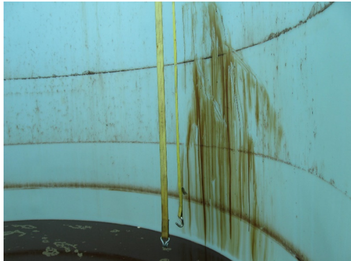
Figure 1: Inside tank wall following decedent's attempt to climb out

MIFACE identified the following key and possibly contributing factors: