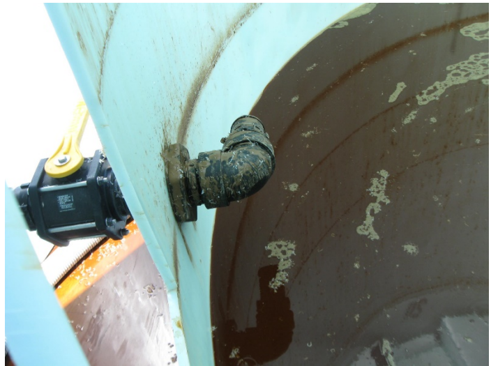
Figure 2: Valve used to pump out contents of tank. Molasses and water mixture remaining in tank can be seen to right of photo.

On the day of the incident, the decedent arrived at work and attended a planning meeting for the day's operations. At the meeting, it was discussed that one of the molasses tanks needed to be emptied and refilled with water to prepare the tank to be recycled. The decedent and one coworker were assigned to drain the tank. The tank was located outside of the main building for the business, grouped with two other similarly large tanks and several smaller tanks and containers on a concrete pad. Beginning around 10:00 AM, the workers diluted the remaining molasses with an approximately equal volume of water, creating a mixture that was 5-6 feet deep. The workers then connected a gasoline-powered pump to a valve near the bottom of the exterior of the tank and began pumping out the molasses-water mixture.