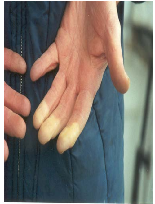
RAYNAUD'S DISEASE FROM WORK IN THE FROZEN GOODS DEPARTMENT AT A SUPERMARKET.