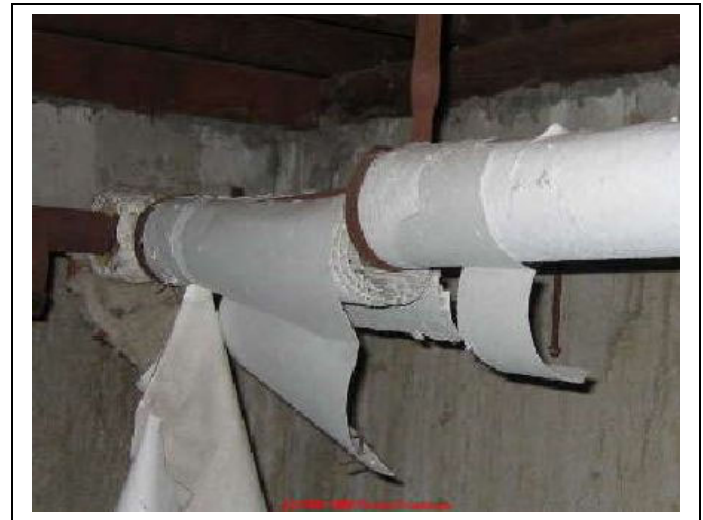
Asbestos-covered pipes. As asbestos pipe lagging ages, it deteriorates and asbestos fibers can be inhaled, especially during repair work to pipes.