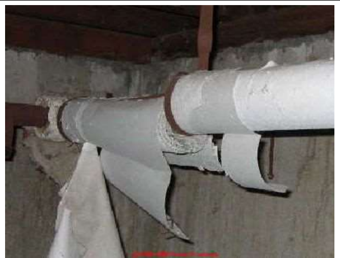
Asbestos-covered pipes. As asbestos pipe lagging ages, it deteriorates and asbestos fibers can be inhaled, especially during repair work to pipes.