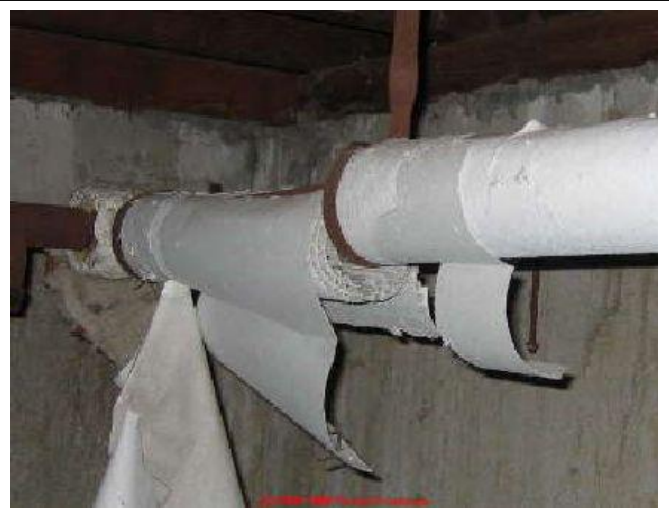
Asbestos-covered pipes. As asbestos pipe lagging ages, it deteriorates and asbestos fibers can be inhaled, especially during repair work to pipes.