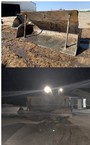
Front view of loader with bucket elevated.