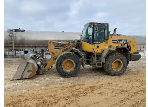
Komatsu Wheel Loader involved in the incident.

The head milker's shift started at 5:30 am that day and the incident occurred at approximately 6:45 pm. The weather at the time of the incident was approximately 28 degrees Fahrenheit and the head milker was wearing brown coveralls, a brown coat, ball cap, earmuff style headphones, and boots. The head milker was working alone, and the likely scenario is that he was crossing the driveway (not frequently traveled during non-daylight hours by pedestrians) with the red can of fuel to refill the heaters in the barn for the night. With the bucket full, the loader operator transporting loads of waste feed, was traveling with the bucket raised approximately 3 feet off the ground. With the bucket raised, the four forward facing lights were obscured by the bucket providing limited light in front of the loader. After dropping off his load and making his return trip to the waste feed barn, the loader operator noticed the head milker lying in the driveway. The loader operator was not aware they had struck anyone. Once the loader operator parked and discovered that the head milker was severely injured, he contacted the farm manager. The farm manager's wife called 911. Dispatch was notified and EMS was on scene with the victim 12 minutes later. The head milker was pronounced dead at the scene.