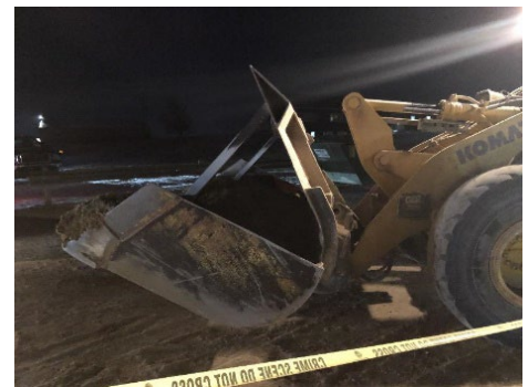
Side view of loader with bucket elevated showing lights obscured.