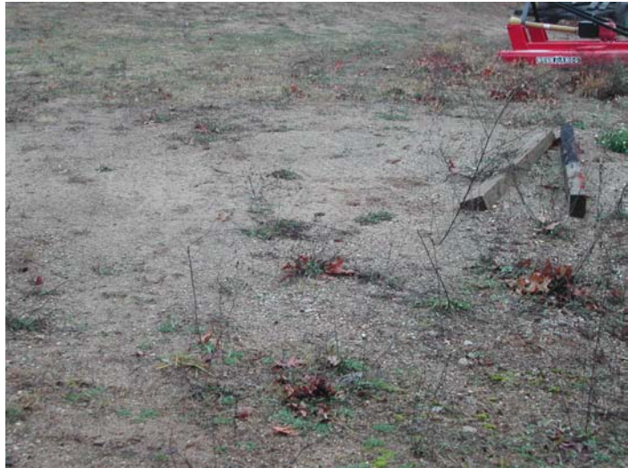
Figure 2. Location of mower while being repaired

The victim was working on a Bush Hog Brand Rotary Cutter Model 3210. According to the manufacturer's literature found on the Internet, the rotary cutter had a 10 1/2-foot cutting width and weighed 2,741 pounds. The Ford tractor he used to lift the mower was equipped with a 7600 Bush Hog Brand front-end loader/bucket. A few days prior to the incident, when using the tractor and mower, the mower ran over some fence wire. The wire became entangled in the mower blades and the victim parked the mower in a field. The ground where he left the mower was covered by a layer of what appeared to be fine mortar sand.