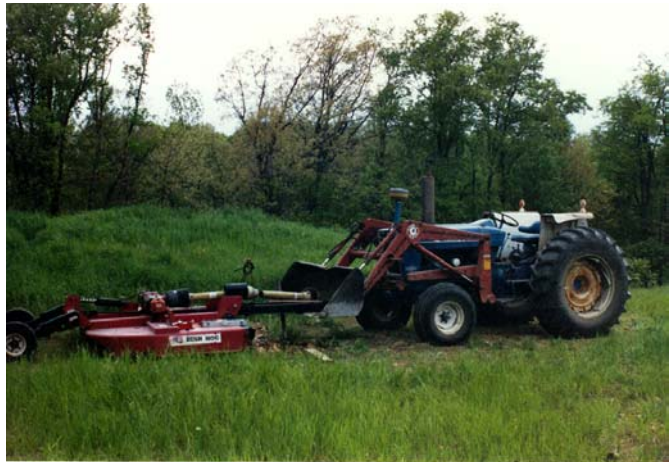
Figure 1. Incident Scene

On May 26, 2003 a 56-year-old horse farm owner was killed when he was crushed under a Bush Hog Brand Rotary Cutter Model 3210 rotary mower while changing the cutting blades. A few days before, he had cut a field and noticed that there was a problem with the mower. He left the mower at a location other than the utility barn. The floor in the utility barn was a concrete pad and the ground where he left the mower had what appeared to be dry mortar sand on its surface. (See Figure 1)