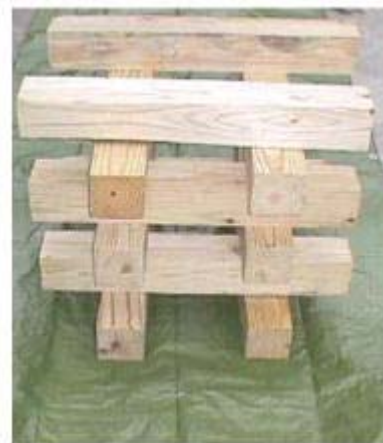
Figure 4. Example of cribbing

Cribbing should be used when the equipment must be supported at a height greater than blocking can provide. Cribbing involves placing timber in tiers that run in alternate directions. To place cribbing, raise the load and without placing yourself under the elevated load , place the cribbing under the load. (See Figure 4). Then lower the load onto the cribbing. If using a jack to raise the load, make sure the jack is on a firm foundation (use blocking timbers as required), raise the load to the maximum height the jack can safely lift to, place cribbing, then lower the load.