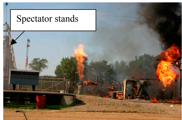
Figure 3. Location of spectator stands in relation to the fuel storage area

The pumps' wiring was wired to one switch to turn both pumps on and off and was not explosion proof. The fuel would not dispense until the pump handle was removed.