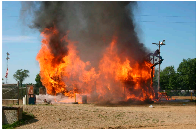
Figure 1. Site of burning storage shed

On July 30, 2005, at approximately 5:20 p.m., a 49-year-old male auto dealer/ buyer working as a race car fuel dispenser, died from injuries received when a methanol tank at an automobile racetrack exploded in the fuel building (Figure 1). The wooden fuel building was constructed of sheet plywood supported by 4- by 4-inch and 2- by 4-inch wood supports. The fuel building housed both the pit concessions and the fuel storage and dispensing area. The decedent had filled several plastic fuel containers for the racers at the racetrack. It is unclear if he was filling another container, or was transferring