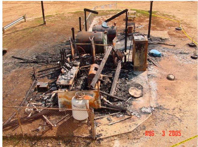
Figure 2. View of Concession stand and fuel storage from spectator stands.

The fuel dispensing and storage area was constructed with 8-foot-high walls. At the top of the area's three walls was an opening approximately 18 inches high that was covered by wire screening material. According to the owner, a No Smoking sign was present. Within this area were two above ground metal fuel storage tanks. On the east side of the fuel dispensing and storage area was a 500-gallon tank containing 110 octane leaded gasoline racing fuel and on the west side was a 1,000-gallon tank containing methanol. The owner estimated that the racing fuel tank held approximately 200 gallons of fuel and the methanol tank held approximately 20 inches of material at the bottom of the tank at the time of the incident. The fuel storage tanks were not portable, but were not permanently affixed to the cement floor. The storage tanks did not have vent stacks. Using MIOSHA Part 39, Design Safety Standards for Electrical