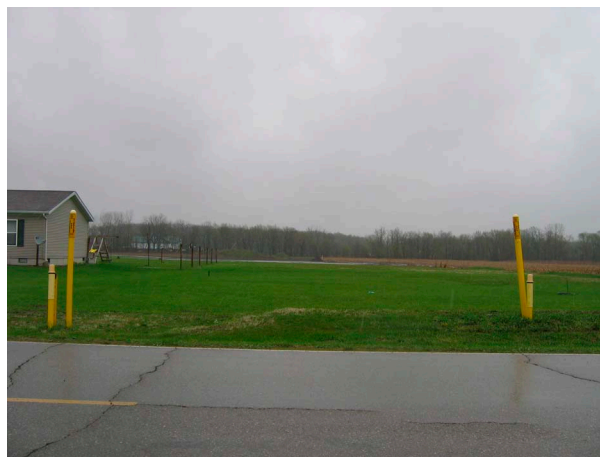
Figure 3. High visibility yellow markers on Road A

Following their training, electrical company personnel looked for and recognized utility MISS DIG flags, but did not appear to look for other markings for underground facilities, such as the high visibility yellow markers for the two underground, high-pressure, natural gas pipelines. Although the markers were in plain sight on Road A, apparently they were missed (Figure 3) or the workers may have thought that the lines were deeper than the level they were digging. Employers should include in their excavation training a segment that requires workers to look for all utility markers in addition to MISS DIG flags and to not assume lines are deep.