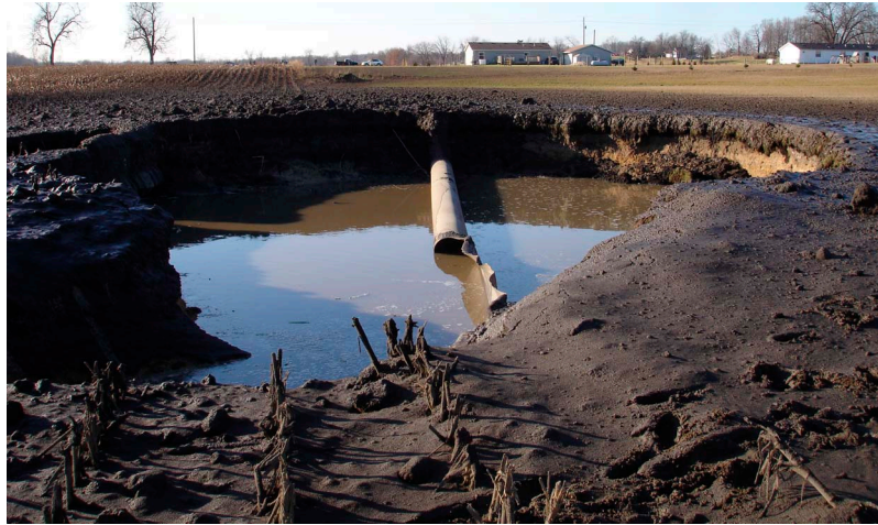
Figure 1. Incident scene showing crater and pipeline

On December 19, 2006, a 27-year-old male lineman was killed when the Flextrak 75 vibratory plow he was operating struck a 24-inch diameter high-pressure natural gas line. The decedent was a member of a three-person crew installing a transformer, and an underground secondary and primary service for two residential homes. The electrical company had contacted MISS DIG