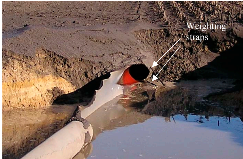
Figure 2. Weighting straps on pipeline.

There were two natural gas pipelines in the construction area. One pipeline was 22 inches in diameter. The pipeline that was struck was 24 inches in diameter. The electric company indicated that the pipelines had been laid in the 1950s. The 24-inch pipeline was pressurized to 800 psi. Pipe composition, integrity, and maintenance are unknown. The electric company indicated that the area had a high water table and that the pipes were “held” in place by straps with cement weights. The electric company indicated that as part of their investigation of this incident, local farmers had stated that they had hit the pipes during plowing and had contacted the gas company to inform them that the pipes had been hit during plowing.