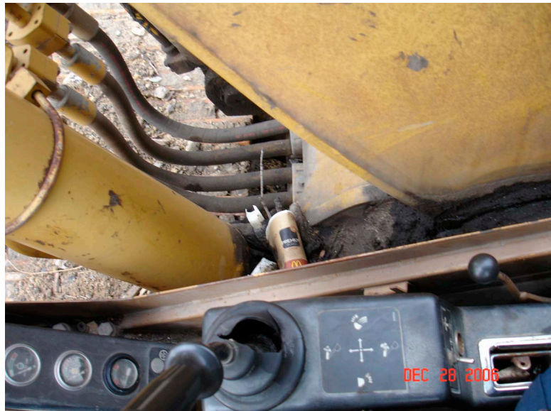
Figure 3. Position of excavator boom, boom control lever, and cab window area

The main boom of the excavator extended almost straight up. The decedent also asked the excavator operator if he could get his dump truck bed emptied in order to repair the vehicle. The decedent jumped off the machine and began to walk away. Only a few feet away, the decedent stopped and turned and jumped back onto the track in the same position as before. He once again told the excavator operator that he was going to get some torches. The relationship between the decedent and the excavator operator is unknown. For reasons