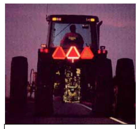
Figure 5. Center SMV emblem equipped with ASAE 276.6 recommendations

The new SMV emblems have fluorescent material aiding daytime visibility and reflective material aiding nighttime visibility (Figure 5). Replacing worn SMV emblems is important because the orange fluorescent center portion of the SMV emblem fades and turns color over time, changing from orange to yellow, pink or white. This portion is the most vulnerable to light and moisture degradation because fluorescent dyes decompose.