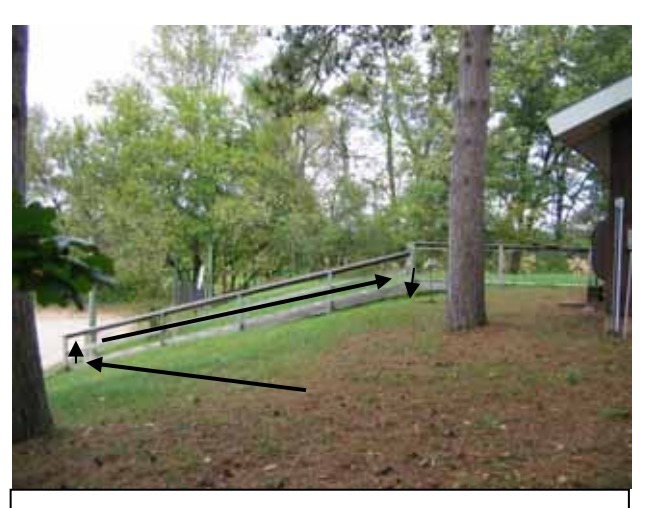
Figure 2. At top of hill, facing north looking through two trees near the building.

The camp was located at the end of a road on the east side of a cul-de-sac. The camp building was five feet away from the nearest tree. There was 16 feet 6 inches between the two trees shown in Figure 2. The ground was fairly level approximately 16 feet from the building and then the slope of the hill commenced. The hill undulates and there was a knoll approximately 10 to 12 feet from the edge of the road. The decedent had mowed this property for over 30 years.