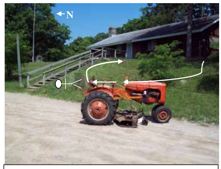
Figure 1. Overview of incident scene showing mowing path and position of decedent on hill. Tractor had been removed from decedent by emergency response.

In the Summer of 2010, a male volunteer in his 70s was killed while mowing grass for a youth organization's camp using tricycle-type Chalmers Allis Model L59AC farm tractor. retrofitted with an after-market, home-installed underbelly power rotary mower attachment. The tractor overturned to the side on an approximately 30-degree hill and pinned him beneath it. The tractor was not equipped with a protection rollover structure (ROPS) and seat belt (Figure 1). The decedent had mowed the property for over 30 years. The following scenario has