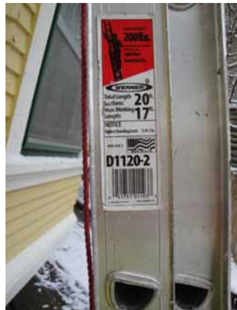
Figure 3. Incident Ladder label. Ladder at ladder owner's home.

To access the second story window, the decedent did not use the company-issued 28-foot fiberglass extension ladder stored in the ladder rack on the top of the company owned vehicle. Rather, he borrowed a Type III, 20-foot aluminum extension ladder from a neighbor to reach the second story window located 19 feet 7 inches above the ground. The owner stated that the decedent did not like to use the fiberglass ladder because it was too heavy and awkward to retrieve and place onto the ladder rack on the roof of the van. The decedent placed the aluminum ladder 4 feet 6 inches away from the house and fully extended it to its maximum working length of 17 feet. The maximum standing height of the ladder was 13 feet 1 inch. The maximum reach was 19 feet, assuming a 5-foot 6-inch person with a 12-inch vertical reach (the decedent was six