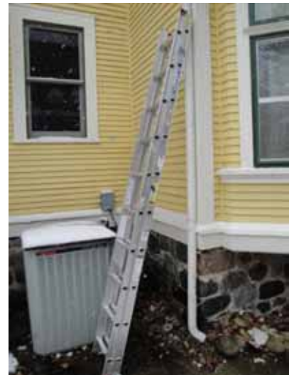
Figure 4. Ladder involved in incident at ladder owner's home

The decedent fell backward from the ladder and was found lying on his back with his right foot on the second ladder rung (Drawing 1). In his hand he was holding either nails or screws (one police officer described he was holding nails and one police officer described he was holding screws). A hammer and a pry-bar were lying on the driveway near the decedent's head. The ladder was still propped against the home. The cable line had been detached from the home. The decedent was declared dead at the scene.