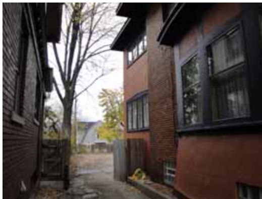
Figure 1. Overview of incident scene

The scope of work for this home included repairing/replacing missing or damaged latches, new storm windows in the eating nook, glass repair in den, epoxy/re-caulking repair where needed on window sashes and ensuring casement windows would close properly.