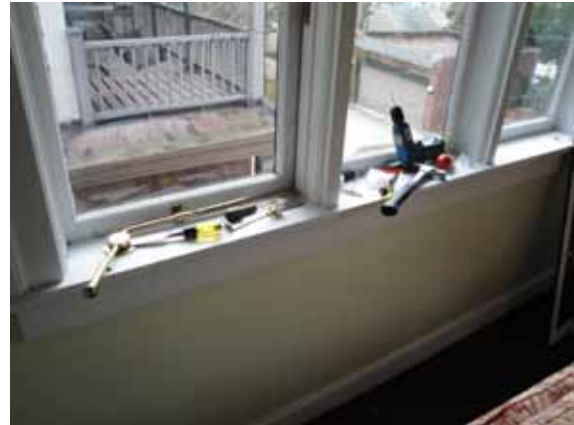
Figure 2. Work performed inside of home

The decedent worked alone on Thursday. On Friday, the incident day, the decedent arrived at the shop at approximately 7:00 a.m. to pick up an interior window and receive instruction for work to be performed. The firm owners instructed him to install some second story interior storm windows/latches and weather stripping. He picked up a second story casement window and left the shop. He was not instructed to perform any work outside the home.