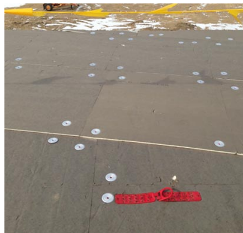
Figure 3. Roof anchor located inside of the warning line on northwest roof corner

The foreman left the roof to obtain more roofing material.