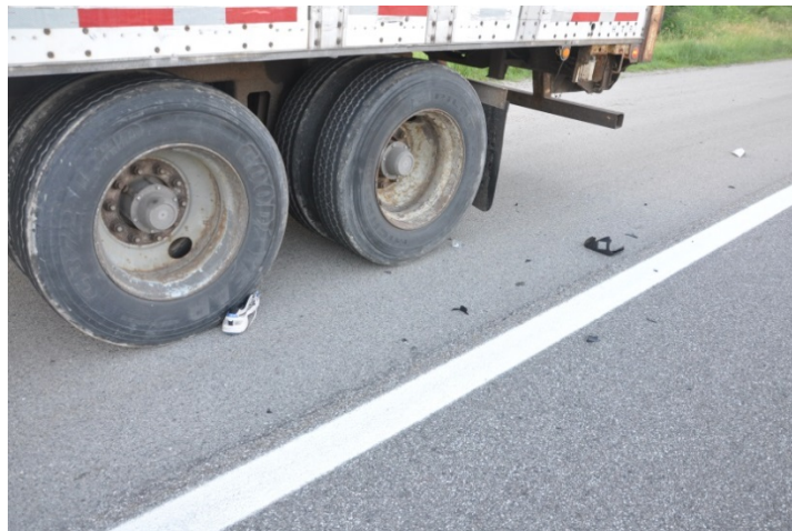
Figure 1. Assumed location of the decedent when he was struck by oncoming vehicle based on his shoe location under the rear tire.

In summer 2014, a male truck driver owner/operator in his 50s died when he was struck by a vehicle in a hit-and-run incident after pulling his northbound 2005 International Tractor semi-truck with a box style attached empty trailer over to the right shoulder of a dry, 4-lane lane expressway with a posted speed limit of 70 mph. The roadway was unlit and curved slightly to the west. Paved shoulders were present on both sides of the expressway. The decedent had been on his cell phone with his spouse when he told her that another vehicle driver motioned to him that there was a problem with the