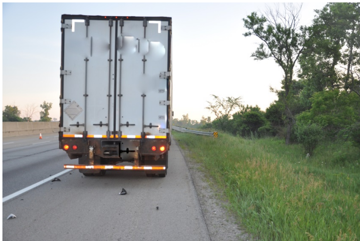
Figure 5. Tuck parked on roadway showing room to walk on non-active roadway side to access the rear of the trailer.

It is unknown if the decedent was walking facing traffic, turning to walk back to the tractor or in the process of walking back to the tractor when he was struck by the car. If it is necessary to walk on the traffic side of the tractor/trailer, truck drivers should always assume that other drivers cannot see them outside the vehicle. Vehicles traveling at 70 mph (approximately 102 feet per