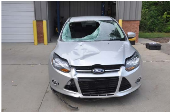
Figure 4. Vehicle damage after striking the decedent.

walked to the back of the trailer to determine if the trailer lights were lit. The incident occurred while he was either walking to or returning from the back of the trailer. He was positioned near the fog line on the roadway side. It appears, based on the location of the debris from the crash and the final resting location of the decedent, that the vehicle driver may have been attempting an evasive maneuver without braking the car; he had crossed over onto the shoulder and then was steering back onto the roadway. The driver struck the decedent and may have struck the rear of the trailer; the mirror was found behind the trailer. The height of the mirror was roughly equivalent to the height of the trailer bed. Passing motorists found the decedent lying face down in the right lane of the roadway near the lane line demarcation between the two right lanes, just north of his semi-truck. Responding police did not note any pre- or post-impact braking by the oncoming driver.