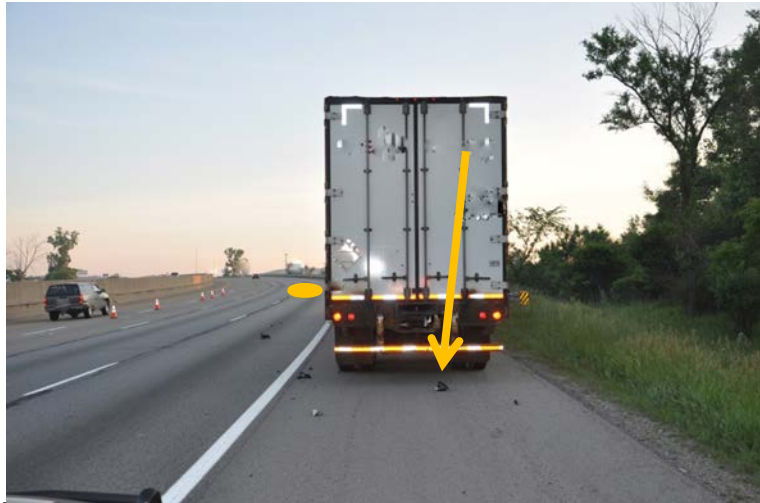
Figure 3. Truck location on shoulder. Yellow arrow identifies mirror location. Yellow circle identifies decedent’s location on roadway after being struck by the car.

A possible incident scenario was developed: At approximately 4:40 a.m., after parking the semi-tractor/trailer unit, placing the unit in park, leaving his headlight lit, he activated the emergency flashers and exited the cab (See Figure 3). He was wearing a light colored shirt and light khaki pants. He was not wearing a high visibility vest/coat. He checked the electrical connection to the trailer and then