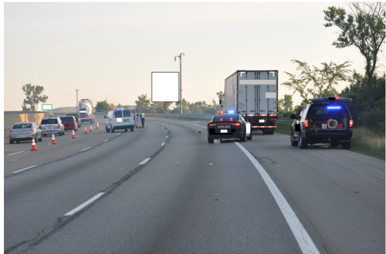
Figure 2. Overview of incident scene. Scene depicts roadway curve and truck position on road shoulder.