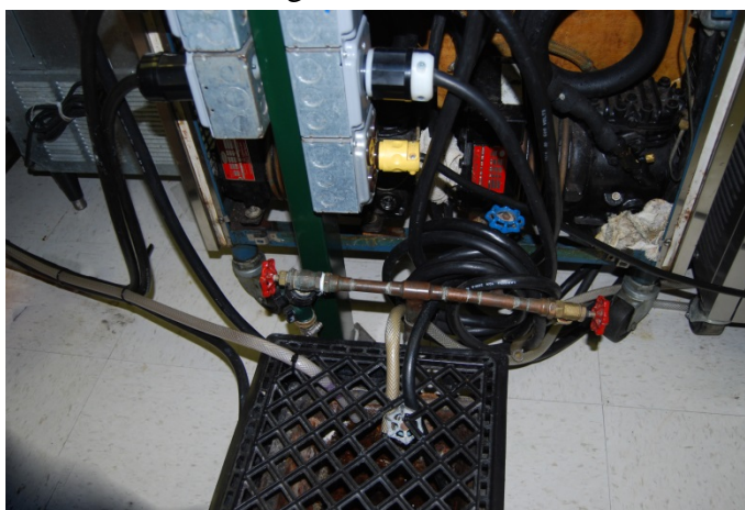
Figure 2. Plastic crate over drain. Note rag in bottom right corner of machine.

The store had three frozen custard machines; he was servicing the middle machine. To make custard, the custard product was drawn by tubes into a water-cooled chamber. Within the chamber were blades, placed in motion by pulleys and belts which turned a spindle and powered the compressor. All three frozen custard machines used a twist-lock 240-volt plug-and-cord power system and were connected to an energized outlet. Due to the age of the machine, he was required to remove the entire back panel to access the machine components. An upside-down rigid plastic crate guided drain hoses to the drain (See Figure 2).