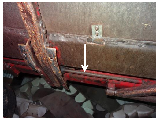
Figure 3. Arrow pointing to sensing rod he may have been trying to unjam.