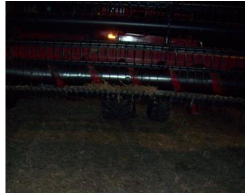
Figure 1. Combine and header involved in incident in field.

In fall 2014, a male farm worker in his 30s died when the unsupported Case International 1680 combine soybean head lowered onto his side during repair activities in a soybean field. The decedent was working alone in the field harvesting soybeans. Although the incident was unwitnessed, it was hypothesized that the sensing mechanism, which permitted the hydraulically operated head to float over the ground became “stuck” in a raised position. The decedent exited the combine and left the combine running. He did not take the combine head out of “automatic” control. He went under the raised combine head with a crescent wrench without providing secondary support (header safety stop) to prevent the head from lowering when repairs were completed. Based on the above hypothesis, the decedent could have been: 1) attempting to make an adjustment directly to the combine head to lower it from the raised position or 2) was striking the floating sensing “rod” which was stuck in the raised position to free the head. When the combine head released from its raised position, it fell onto the decedent, pinning him on his side against the dirt. His coworkers went to look for him when he did not answer his cell phone. A coworker found him, raised the combine head, and backed the combine approximately 15 feet away from him (Figure 1). Combine hydraulic fluid was not observed on the ground, indicating that there was not a leak from the hydraulic lines. He was declared dead at the scene.