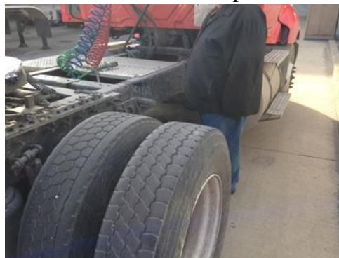
Photo 2. Location of decedent when truck driver drove forward

The decedent and one of his coworkers (Coworker 1) unhitched the newly arrived tanker from the incident tractor. Standing on the north (driver) side of the tractor/tanker, Coworker 1 unhooked the hoses and electric pigtail while the decedent, standing on the south (passenger) side, lowered the landing dolly legs. The decedent was wearing a black coat, black sweatshirt and black baseball cap, and blue pants.