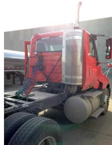
Photo 1. Rear view, passenger side of similar truck

MIFACE identified the following key and possibly contributing factors: