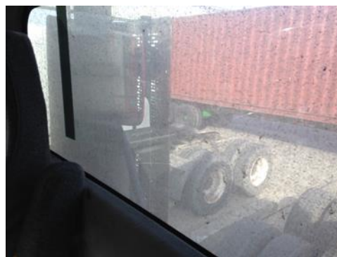
Photo 3. View from driver's seat in truck cab

Coworker 1 stated that he observed the decedent positioned away from the tractor/tanker unit. He stepped forward to inform the tractor driver it was all clear and to pull ahead. At this time, his view was blocked from seeing the decedent. The tractor driver stated he looked out his windows and checked his mirrors prior to pulling forward. For reasons unknown, the decedent had entered a blind spot on the passenger side; he was positioned behind the cab and its muffler system and in front of the rear tandem wheels of the tractor (See Photo 2). Another truck driver observed the positioning of the decedent and honked his horn to warn the driver and decedent but it was too late. As the tractor pulled ahead, the tractor ran over him. Emergency response was called and the decedent was pronounced dead at the scene.