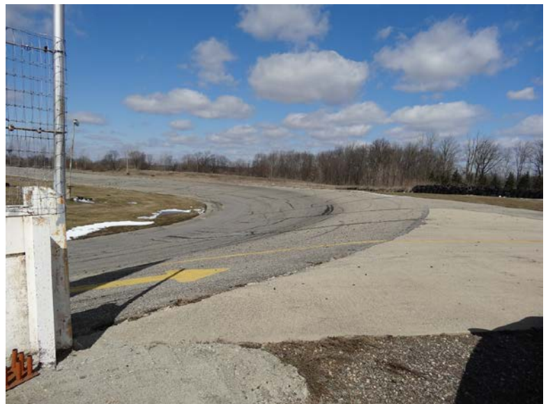
Photo 2. Entrance to track at Turn #2. Click on photo to view video of track.

Between a concrete wall at Turn 1 leading to Turn 2 and a wire fence was the staging location of the Safety Crew. There was a concrete entrance to the track at this location and an open area where race cars could exit the track to the Pit area and where the Safety Crew could enter the track to provide safety services to vehicles, drivers and track clean-up.