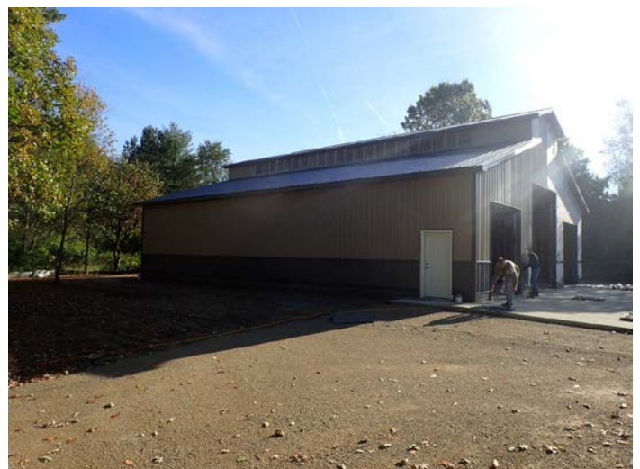
Photo 1. Pole barn under construction

The type of lift was unclear: MIOSHA described the lift as a scissor lift and the owner described the lift as a telescopic boom lift when speaking with the MIFACE researcher. There was no police response for this incident to confirm the type of lift utilized by the decedent to access the roof. Another