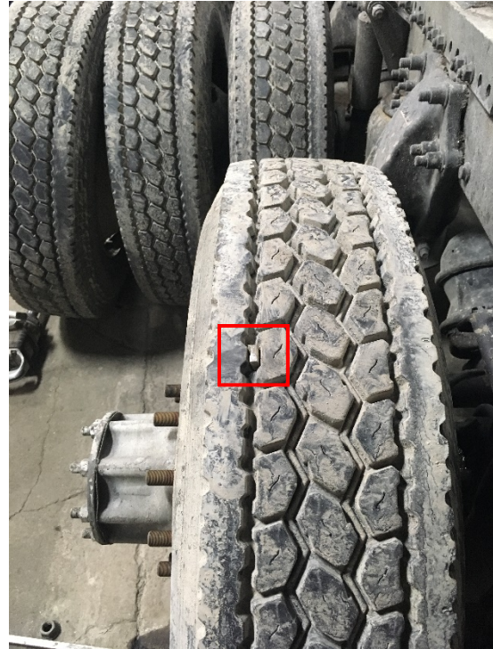
Figure 2: Metal debris stuck in tire

The maintenance area was a closed bay area where drivers were not authorized to enter, and drivers were not generally responsible for the maintenance of their trucks. However, due in part to some of the trucks being owned by independent owner/operators who wanted their drivers to be able to observe and assist in maintenance and repair of their trucks, drivers oftentimes entered the maintenance area while their trucks were under repair.