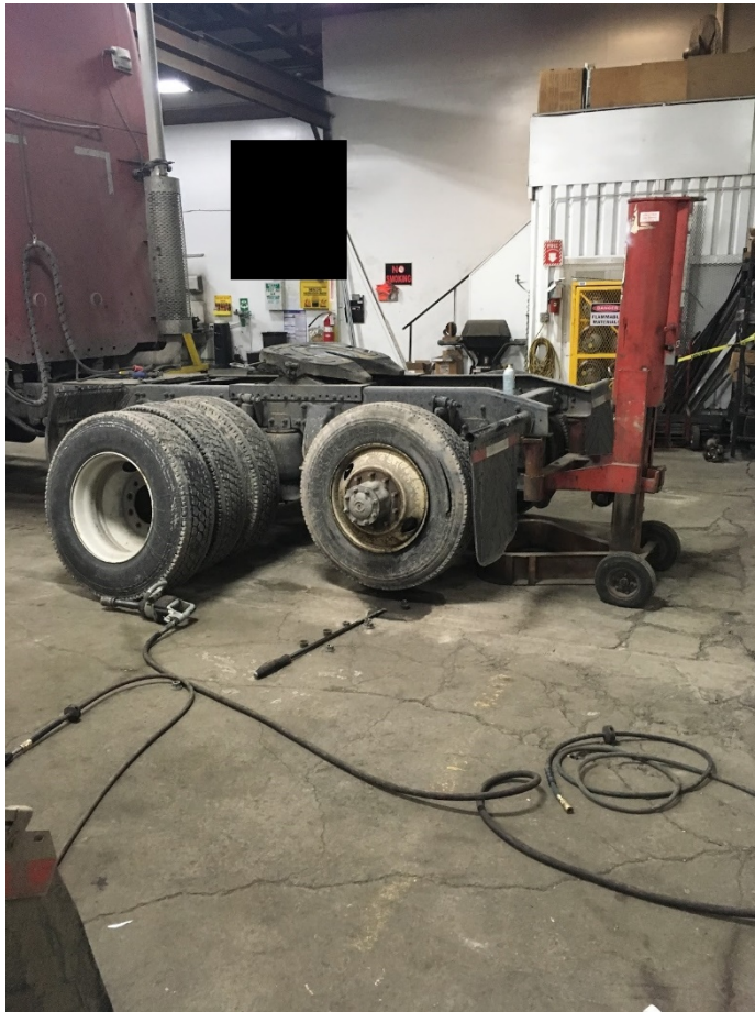
Figure 1: Incident scene

A 61-year-old male truck driver died in the winter of early 2017 when he was thrown onto a concrete floor as a result of air released from a pressurized tire sidewall failure. The decedent was a contract driver for an owner/operator; the owner operator's trucks were leased by the company where the incident occurred. The decedent's truck had a flat inside left tire on the rear axle of his truck; the tire was off bead.