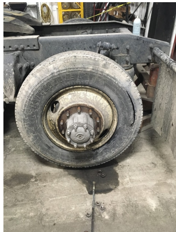
Figure 3: Ruptured tire sidewall

After the incident, the employer instituted new policies regarding drivers' access to the maintenance bay. Combination locks were installed on the entrances to the service area, while training was