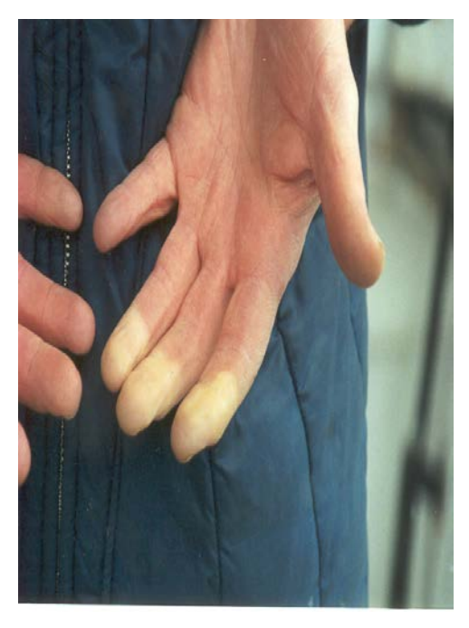
RAYNAUD'S DISEASE FROM WORK IN THE FROZEN GOODS DEPARTMENT AT A SUPERMARKET.